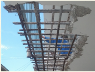
Concrete Spalling Repair

For over 40 years, we have served condo associations, property managers, and building owners in Hawaii. We are experts at working on all types of capital improvement projects. Some of our specialty projects include the following: