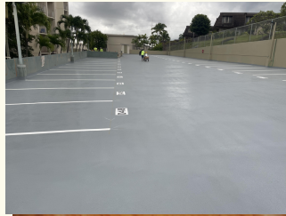
Painting and Waterproofing