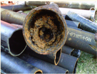
Cast Iron Repiping