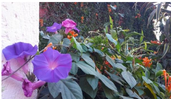
Photo: Guatemala is known for its beautiful tropical flowers. These grow on the front of one of the homestays.