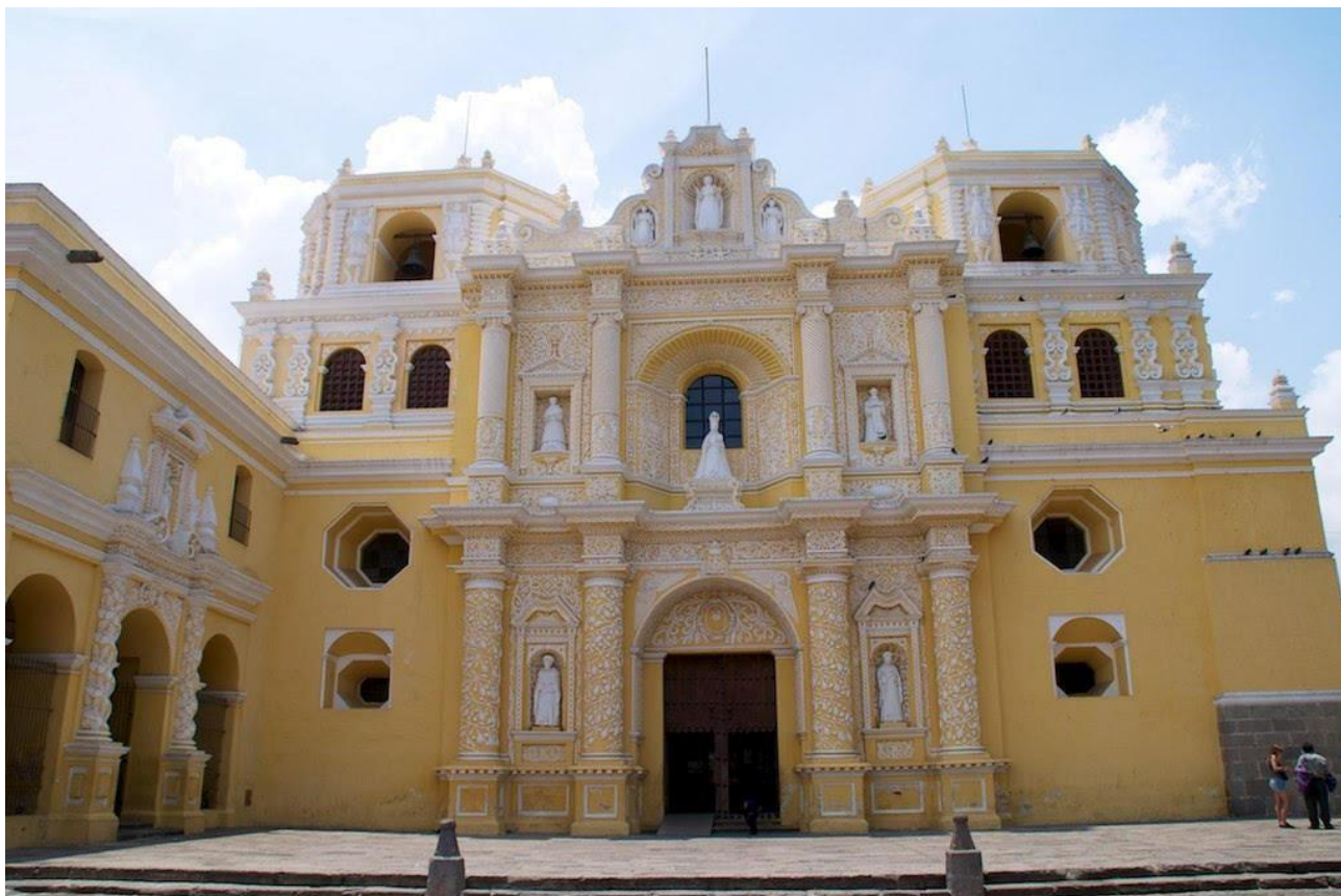
Photo: The Church of La Merced in Antigua, Guatemala. Because of its lace-like detail, it is known as the "Wedding Cake Church".

There are over 37 churches in Antigua. We are happy to honor your religious preference by providing an opportunity for your group to attend a service. Please let us know if that is something you'd like included in your itinerary. Appropriate clothing will be necessary to enter the churches. (Knees and shoulders must be covered.)