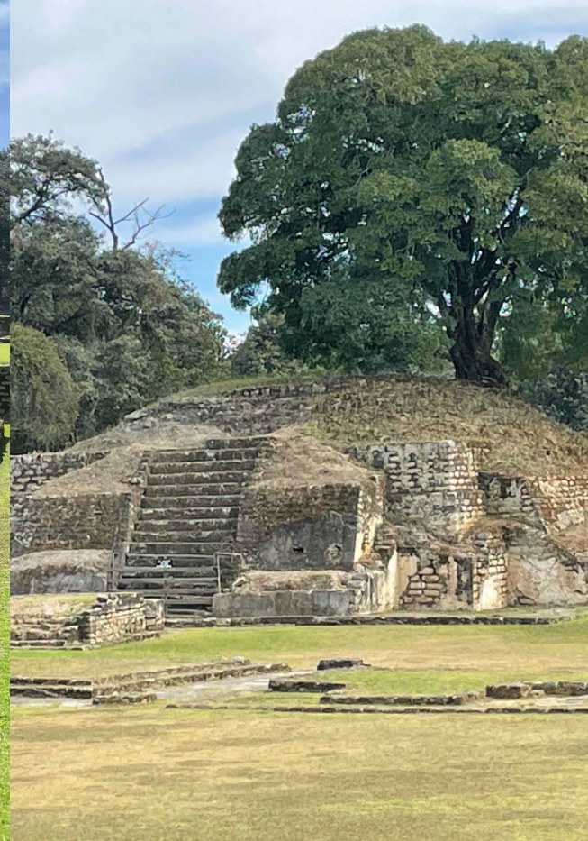
Iximche' Maya ruins