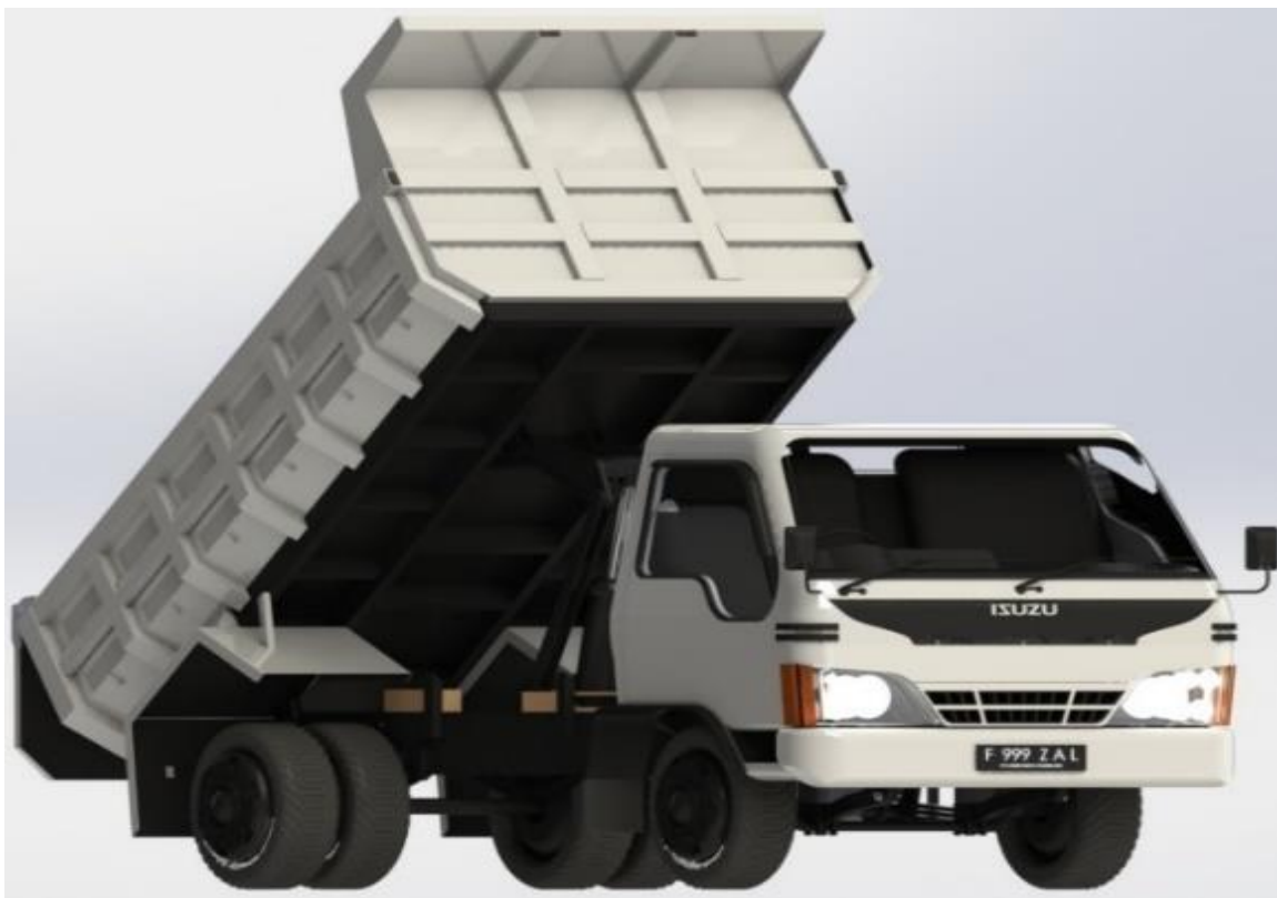
e. Garbage Trucks.