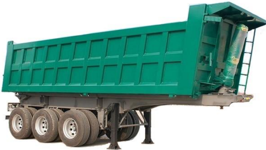
d. Dump Trucks.