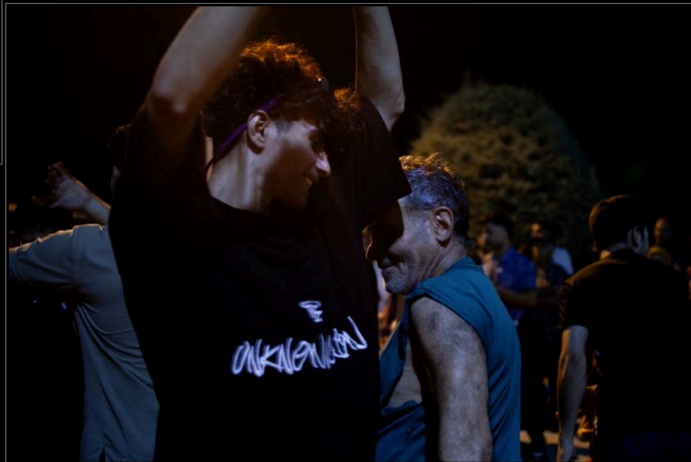
'And all this slips around' (2023-2025) Tehran, Iran