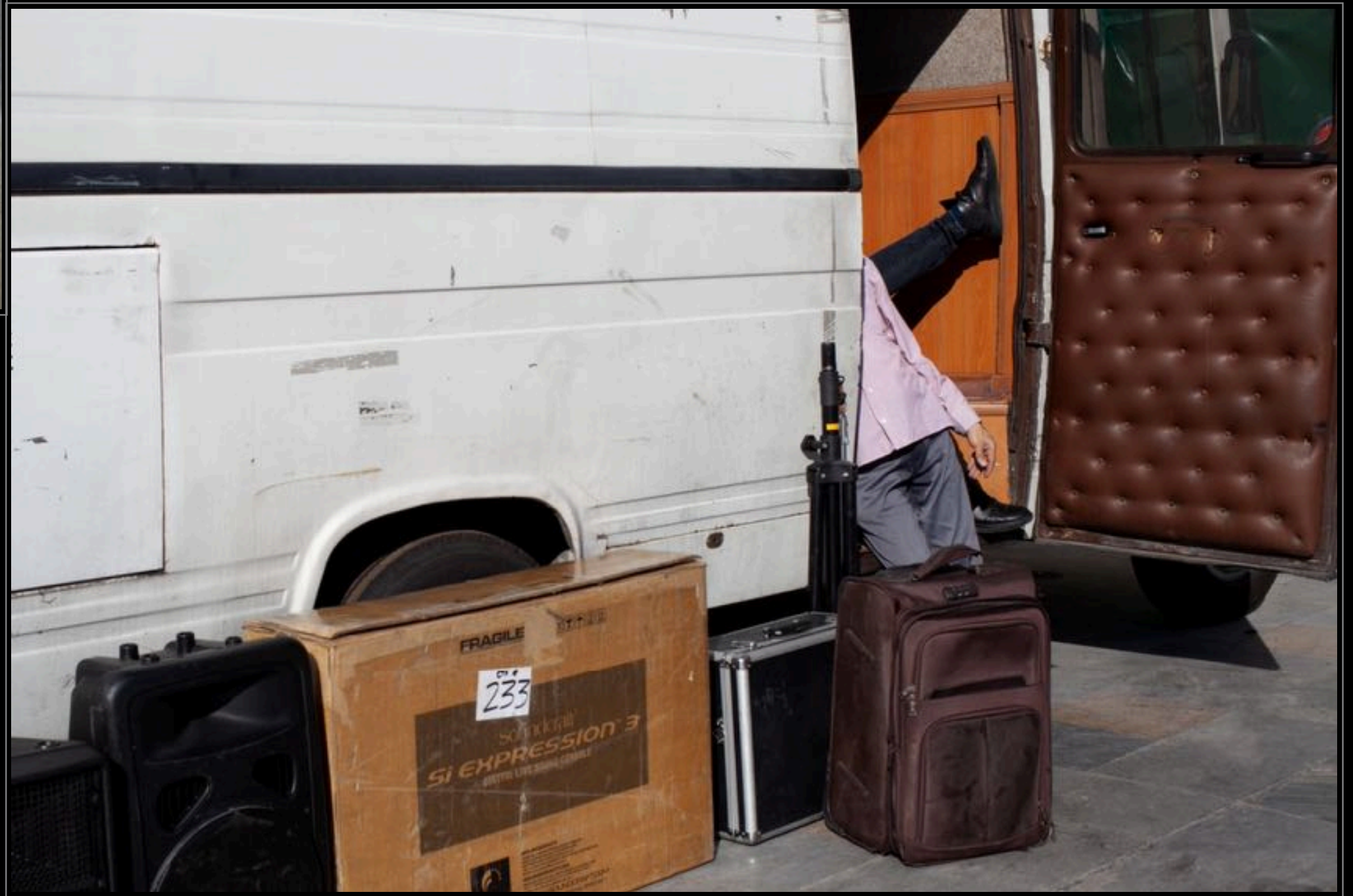
'And all this slips around' (2023-2025) Tehran, Iran