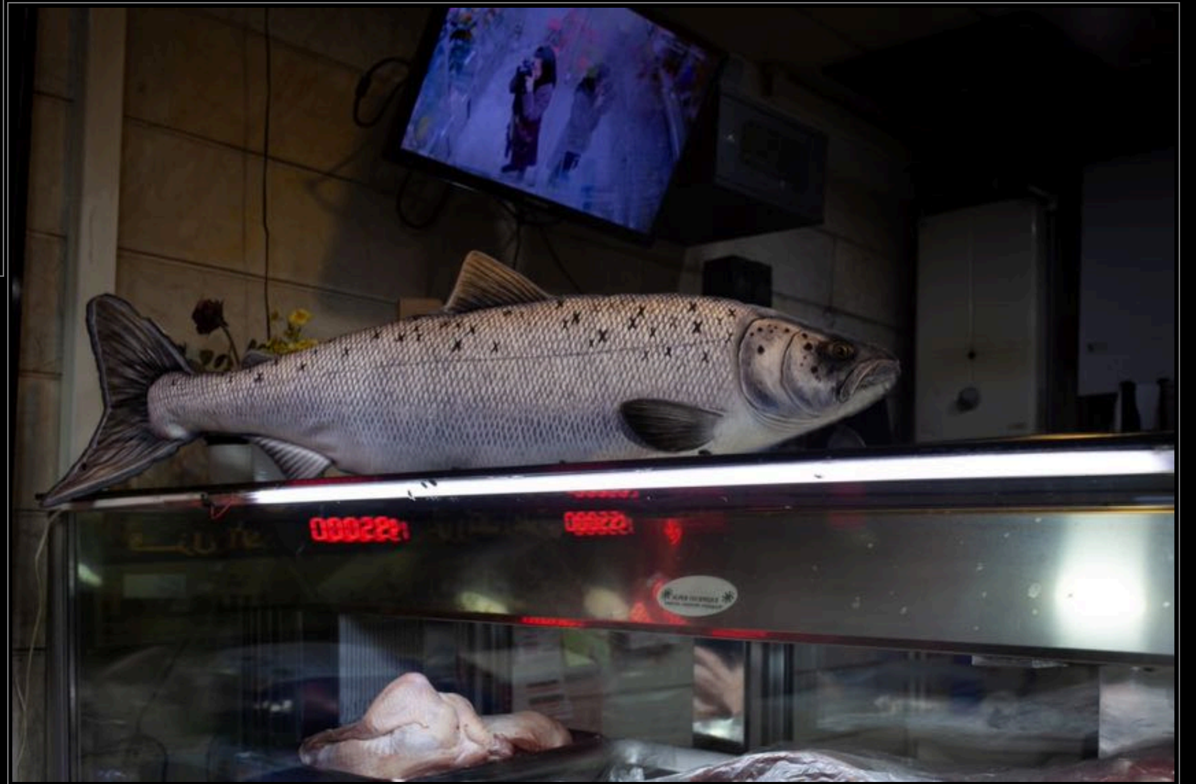
'And all this slips around' (2023-2025) Tehran, Iran