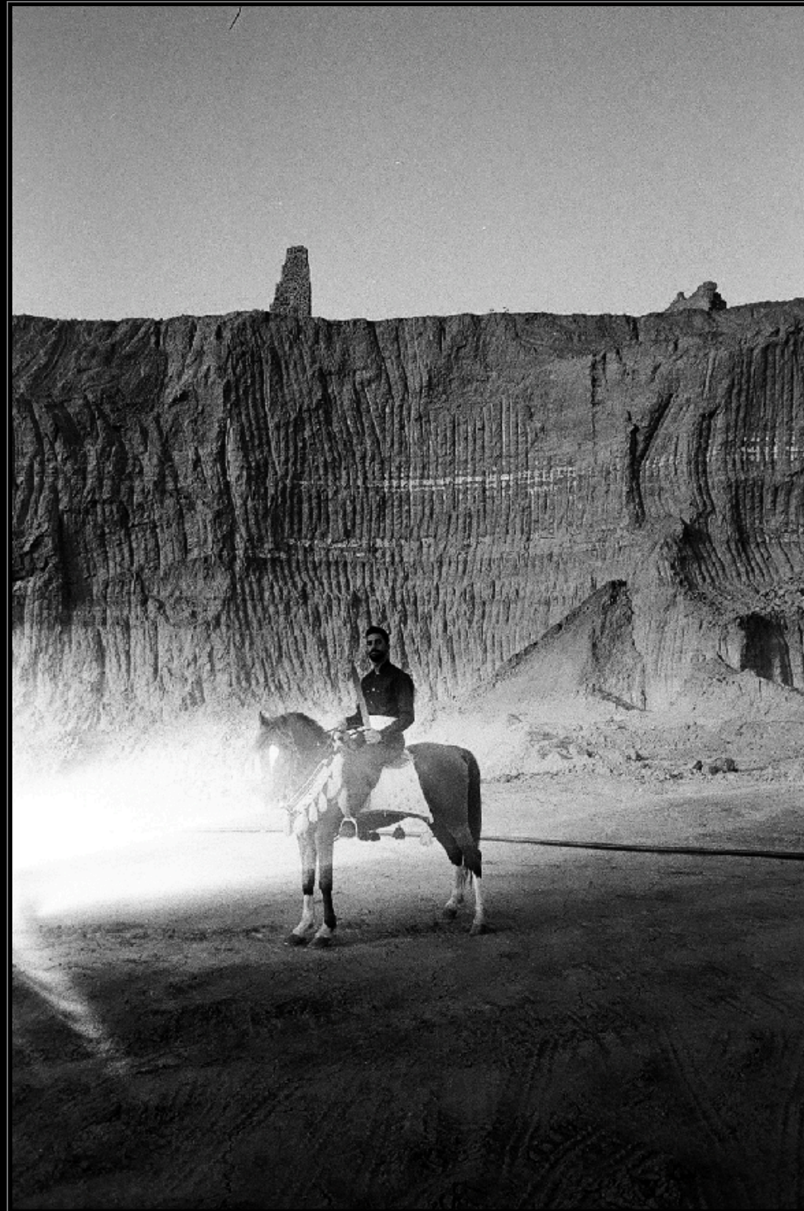
'Madness' series Untitled (2023) Tehran, Iran