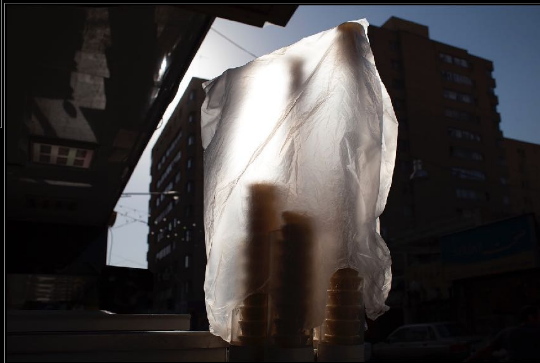
'Pulse' (2018-2020) Tehran, Iran