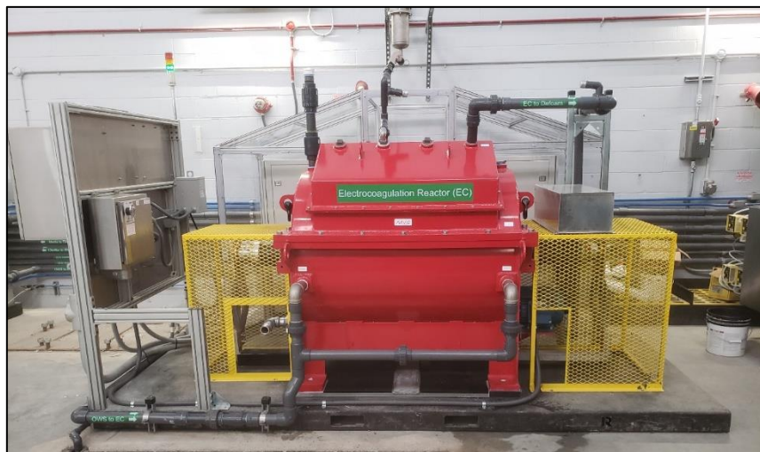
TURBOCOAG ELECTROCOAGULATION REACTOR AT US NAVY BASE