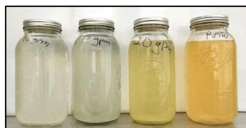
PRODUCED WATER BEFORE AND AFTER TURBOCOAG® PROCESSING.

TurboCoag® is a cost-effective alternative to chemical water treatment via its triple patented electrocoagulation (EC) reactors.