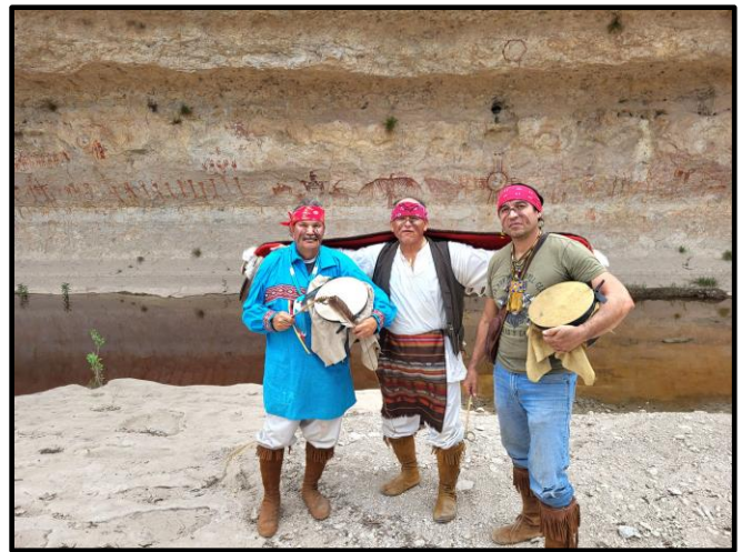
Jumano and Lipan Apache Band of Texas