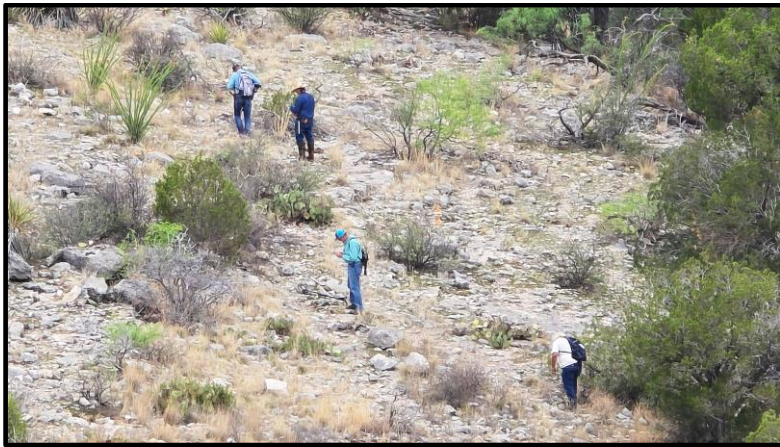
Collecting and mapping artifacts supporting the report