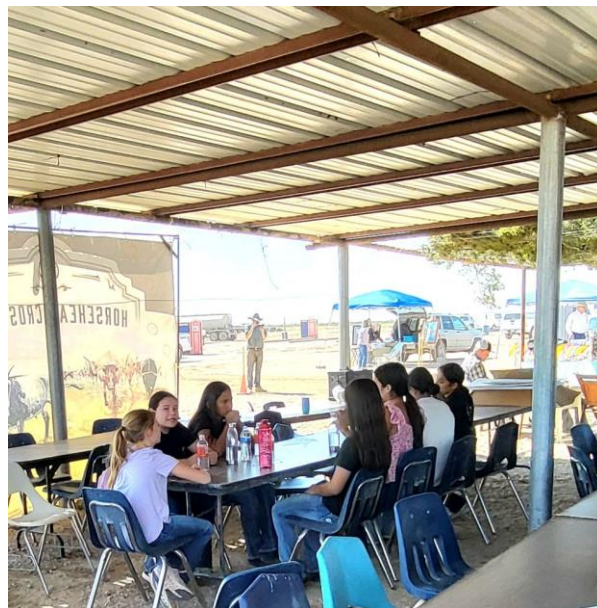
Breakfast, Lunch & Dinner provided free to everyone, and everyone can enjoy under the permanent picnic pavilion