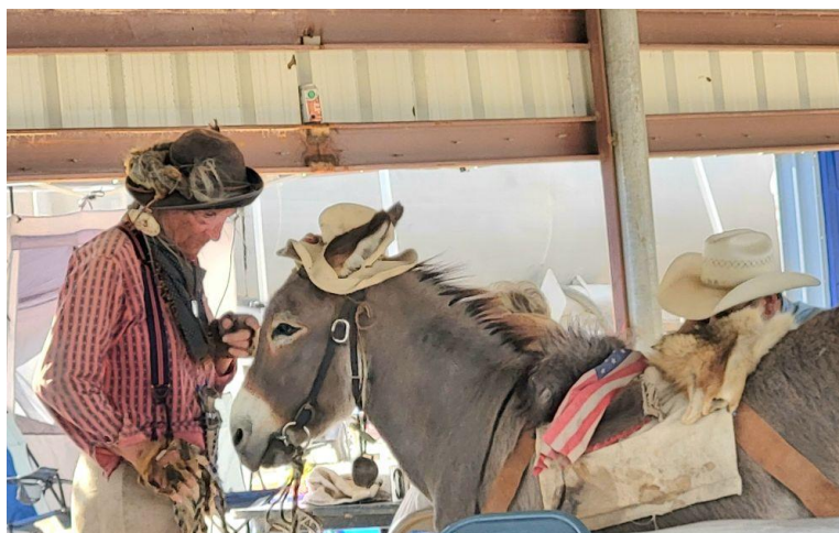
Getting a stern lecture on how to behave in a dining area