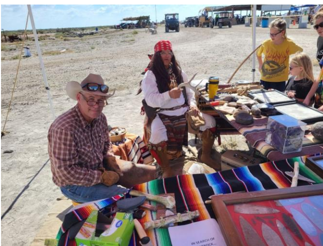
Flint knapping & Apache Display