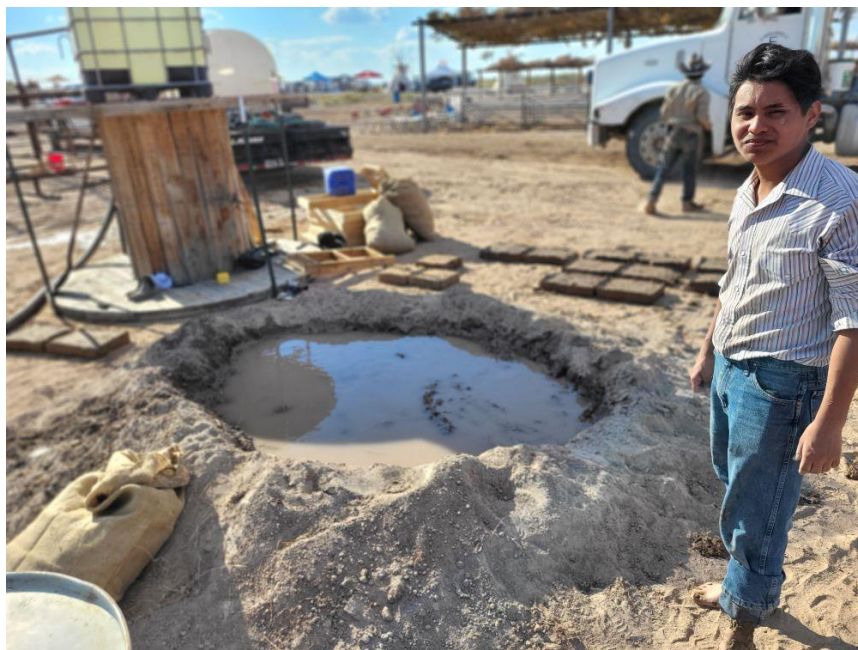
Making adobe bricks (for future lecture pavilion)