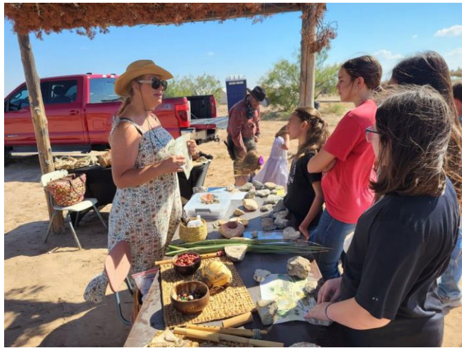
Indian Cultural display