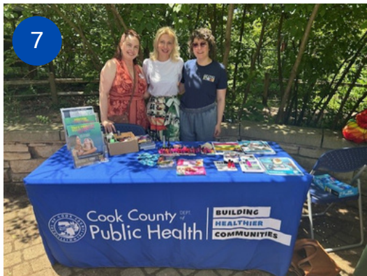
1, 2, 3 – River Forest PRIDE Walk – June 2 4 – A Day in Our Village June 1 5, 6, 7 – TrailsidePRIDE June 21