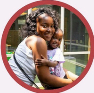
New Moms Participant and daughter.

Centering Black Mothers. Advancing Equity. Strengthening Families.