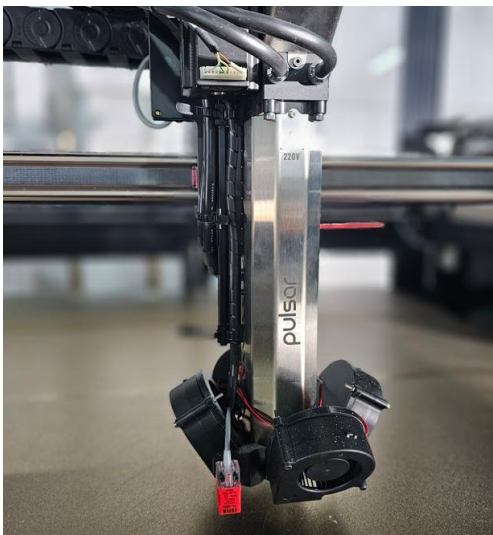
Dyze Pulsar Pellet Extruder 3KG / Hour