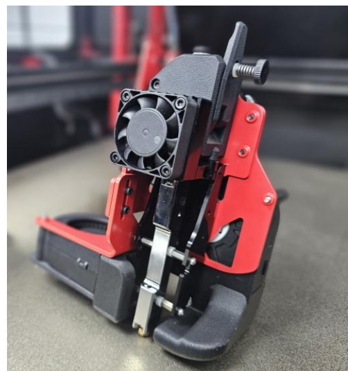
Modix Griffin Ultra Filament Extruder 500 gr / Hour