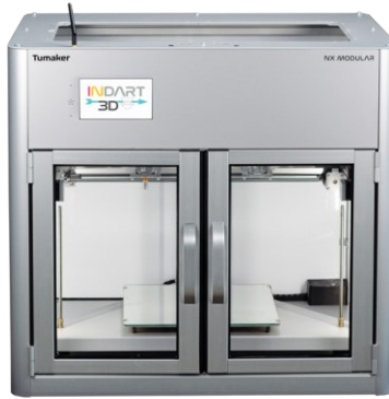
Independent double extruder