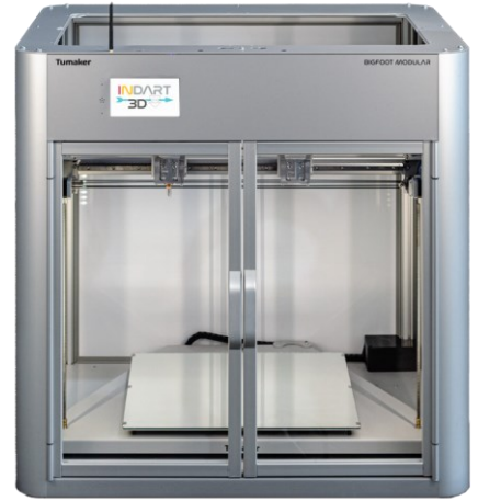
Independent double extruder