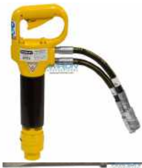
Underwater Hydraulic Chipping Hammers