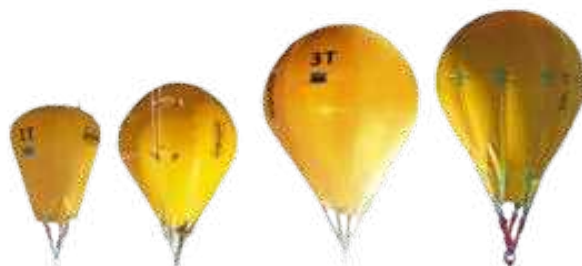
Underwater Air Lifting Bag