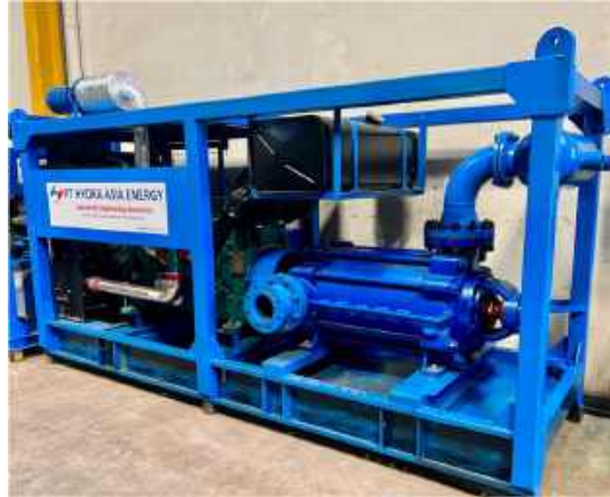
Multistage Pump/Pigging Pump