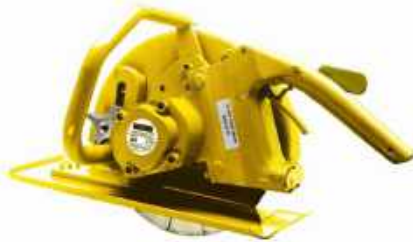
Underwater Hydraulic Concrete Cutter