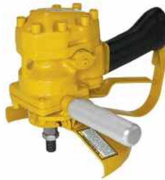
Underwater Hydraulic Grinder