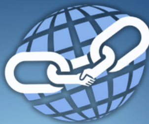
Public Relations (PR)