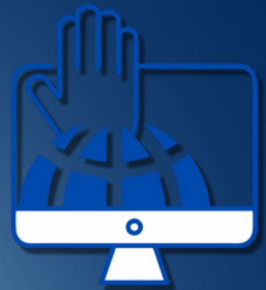
Information & Technology (IT)