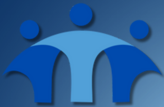
Internal Affairs (IA)