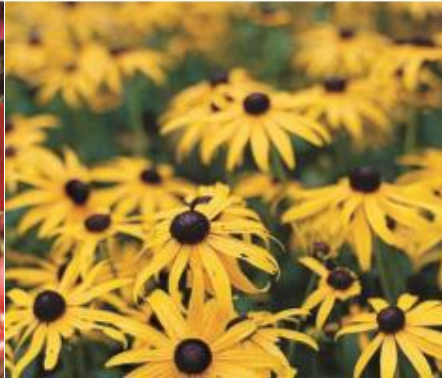
Autumn Beauty Sunflower