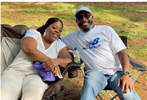
Pastor And 1 st Lady