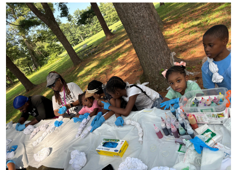
Tie Dye Arts & Crafts