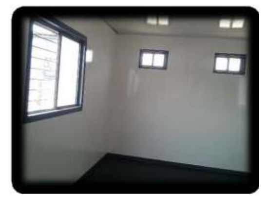
Denel Concrete / Loading Bay