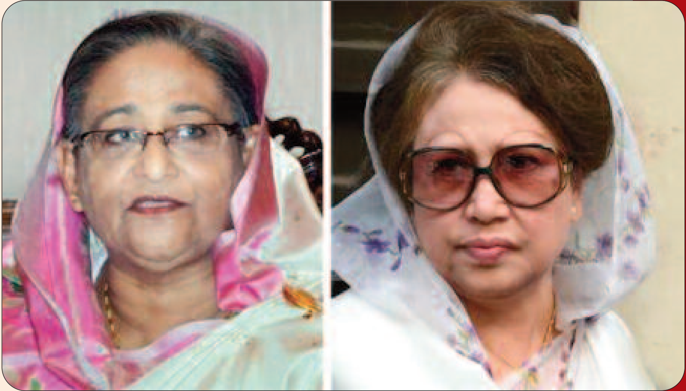
Shaikh Hasina & Khaleda Zia