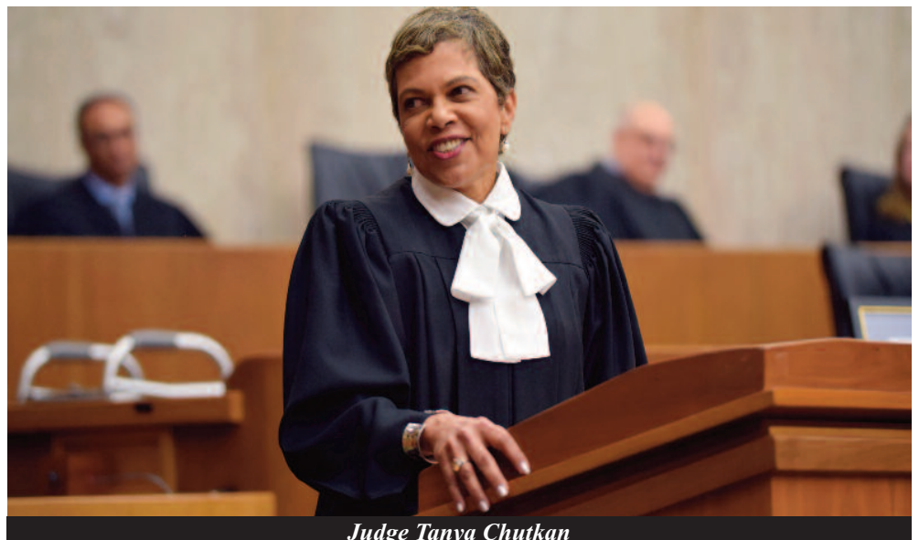
Judge Tanya Chutkan

The trial date remains set for early March, and Judge Chutkan made it clear that the trial would not be affected by the election cycle. It's worth noting that any restrictions on Trump's speech may become a subject of appeal in the case, along with claims that the federal cases are being rushed to secure a conviction before the election.