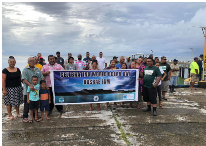
Community members celebrate World Oceans Day in Kosrae

In addition to the virtual Panel Discussion, BPM also celebrated World Oceans Day by supporting a coastal and underwater clean-up event in Kosrae.