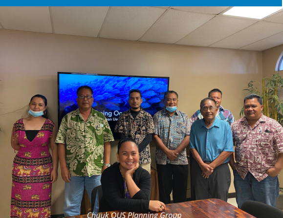
Chuuk OUS Planning Group