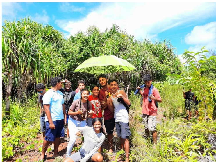
Students conduct field work in Marine Island Ecology course