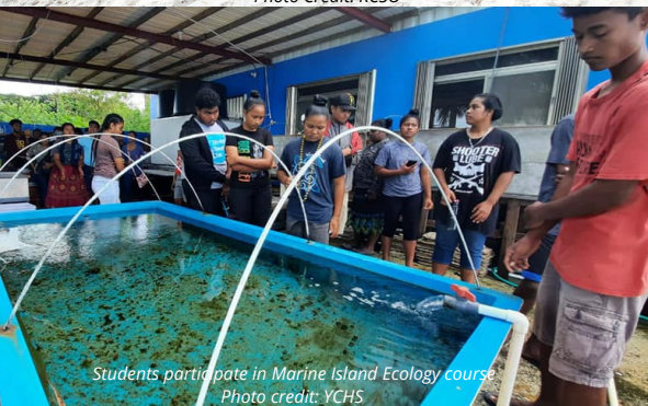
Students participate in Marine Island Ecology course