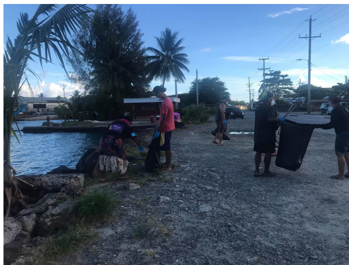
CWC & BPM volunteers clean up near Weno shoreline in Chuuk

BPM awareness campaign activities have been continuing in Kosrae, Yap and Chuuk through partnerships with KCSO (Kosrae Conservation & Safety Organization), YCHS (Yap Catholic High School) and CWC (Chuuk Women's Council). These activities have been focusing on public events, coastal clean-ups, outreach and youth engagement and continue to be shared on the BPM Facebook page. The BPM communications team is also developing an animation video on Marine Spatial Planning to support future outreach and awareness raising efforts.