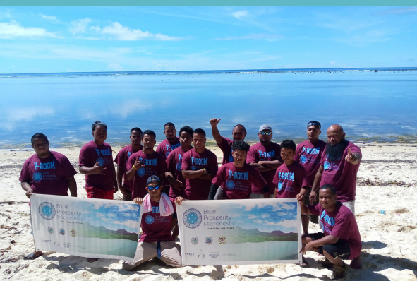
BPM Awareness with Y-Boom Baseball Team in Kosrae

With the Offshore MSP Principles adopted by the Task Force, the Marine Spatial Planning Working Group and support team agreed to hold a Workshop to develop the Offshore Marine Spatial Plan Goals and Objectives. The workshop layout and content has been developed by the BPM team and partners. The workshop, set for August 13th, will bring together the MSP Working Group members plus local partners from each of the states for a hybrid virtual and in-person meeting to discuss and develop the goals and objectives for the FSM's Offshore Marine Spatial Plan, which will also be submitted to the BPM Task Force for consideration and adoption.