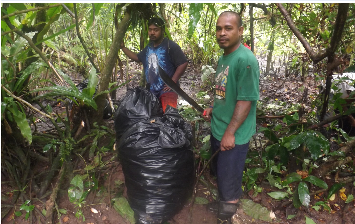
Peidie community mangrove trash pick-up.