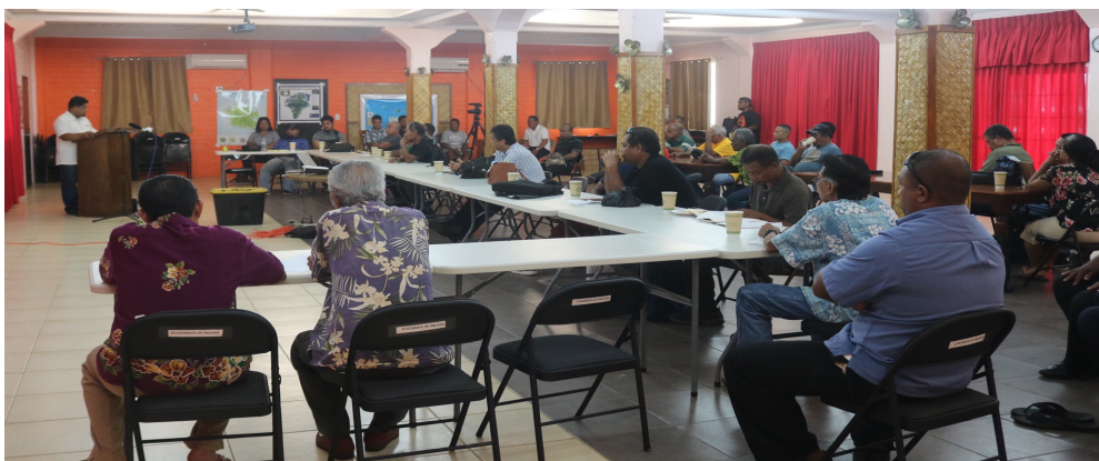
Pohnpei Mangrove Symposium.

Two dry litter piggeries were under construction when the project closed. This aspect of the project highlighted piggery construction as a barrier to change to pig pen owners, identifying the potential need for site visits to working dry litter piggeries for potential owners to see their benefits.