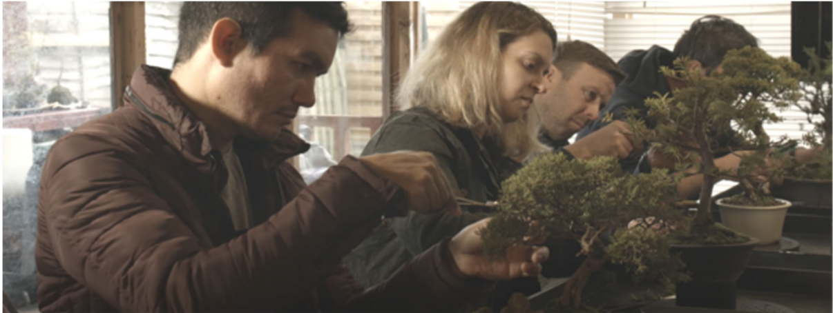
Figure 5 Building Community

While the practical aspects may change, the intellectual and spiritual core of The Mǎ-Kè Bonsai Way remains deeply rooted. Our plan demonstrates a commitment to regenerative growth and ecological responsibility, ready to adapt and thrive in today's ever-changing world.