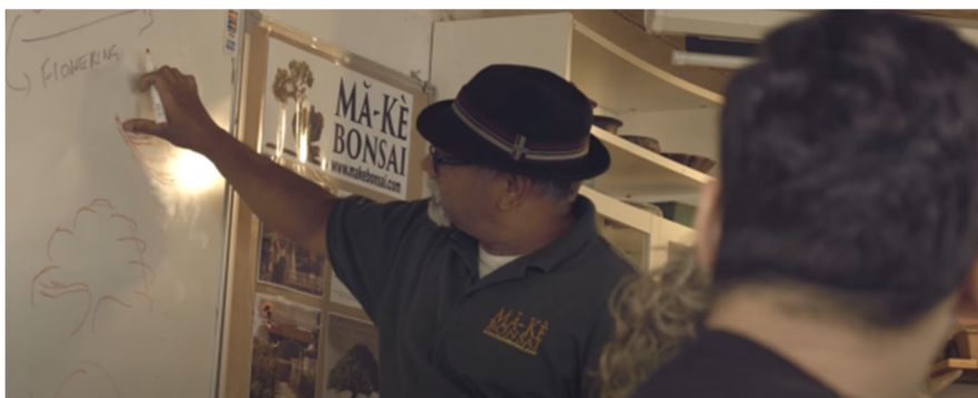
Figure 3 Bonsai Workshop

The Six Hats framework shows us how The Mǎ-Kè Bonsai Way can harmonise with Permaculture ethics and principles to create a comprehensive and regenerative bonsai cultivation paradigm. This integration can improve bonsai trees' aesthetic, lifespan, and environmental advantages while nurturing a stronger bond with nature and fostering mindfulness and well-being among practitioners.