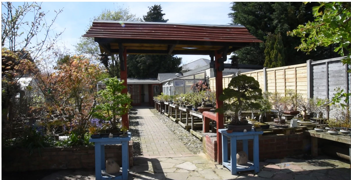
Figure 2 Mǎ-Kè Bonsai Nursery, London

Our mission is to blend traditional Bonsai care and permaculture with a holistic and regenerative approach, deepening our connection with nature and enhancing community well-being. We provide innovative, regenerative education in Bonsai, using online platforms and hands-on projects that integrate Vedic, Ayurvedic, and traditional practices, fostering a harmonious balance between humans, trees, and the natural world.