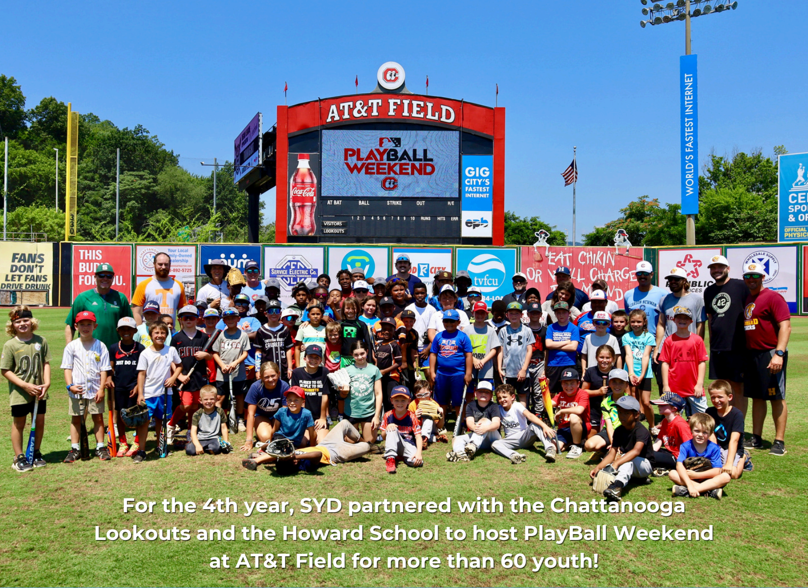
For the 4th year, SYD partnered with the Chattanooga Lookouts and the Howard School to host PlayBall Weekend at AT&T Field for more than 60 youth!