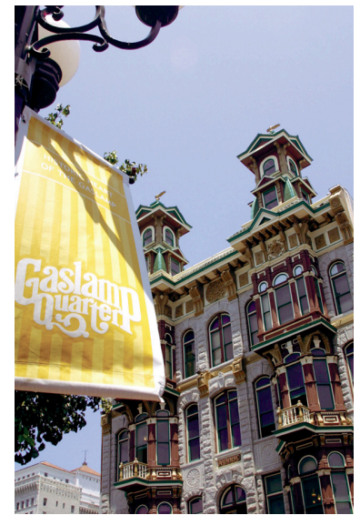
San Diego's Gaslamp Quarter

Based on the response we get through registration form, we will schedule a golf outing at the course next to the hotel. The Golf NCOIC will contact interested golfers.