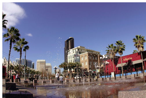
Downtown San Diego