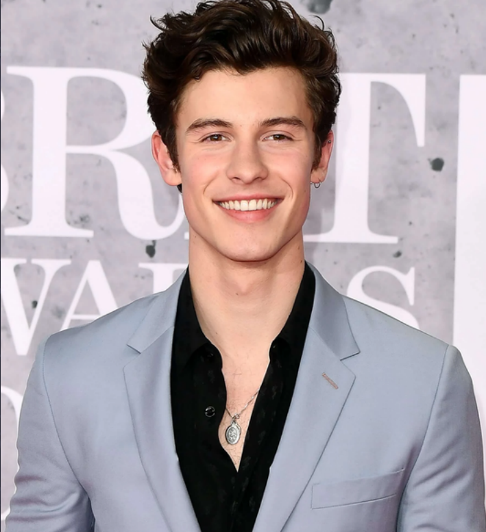
Shawn Mendes 26 years old