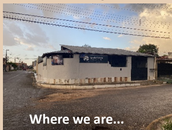
Where we are...

Besides these two endeavors, we also have two more