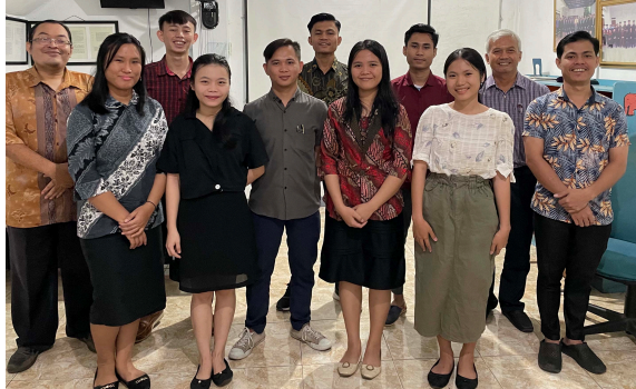
Students at Mampang campus

The month of August has been exciting as well as surprising. A new semester of our Bible college started on August 5 th . I am teaching Human Growth & Development as well as Sunday School Administration on two different Bible college campuses. In the past two weeks, I have gained at least one new student in each location, giving me a total of 28. Some of the students are enrolled full time at the Bible college while others only attend my classes as they desire to prepare themselves to be Sunday School teachers.