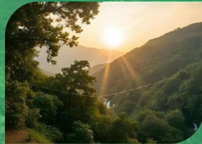
Endless horizons, limitless ideas.

This land is not defined by limits, but by potential.