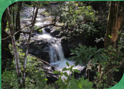
Where water becomes your soundtrack.