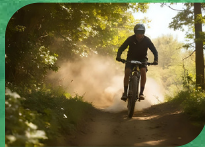
Freedom finds its own path.