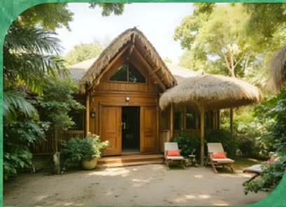
Design in harmony with the jungle.

This land is not defined by limits, but by potential. Eighty-nine hectares of jungle, ridges, and waterfalls invite adventure, creativity, and vision. From eco-lodges and canopy trails to paragliding, downhill routes, or meditative retreats — every idea finds a home here. Cambutal's wild landscape becomes your open-air studio, a living canvas ready to shape the experiences of tomorrow.