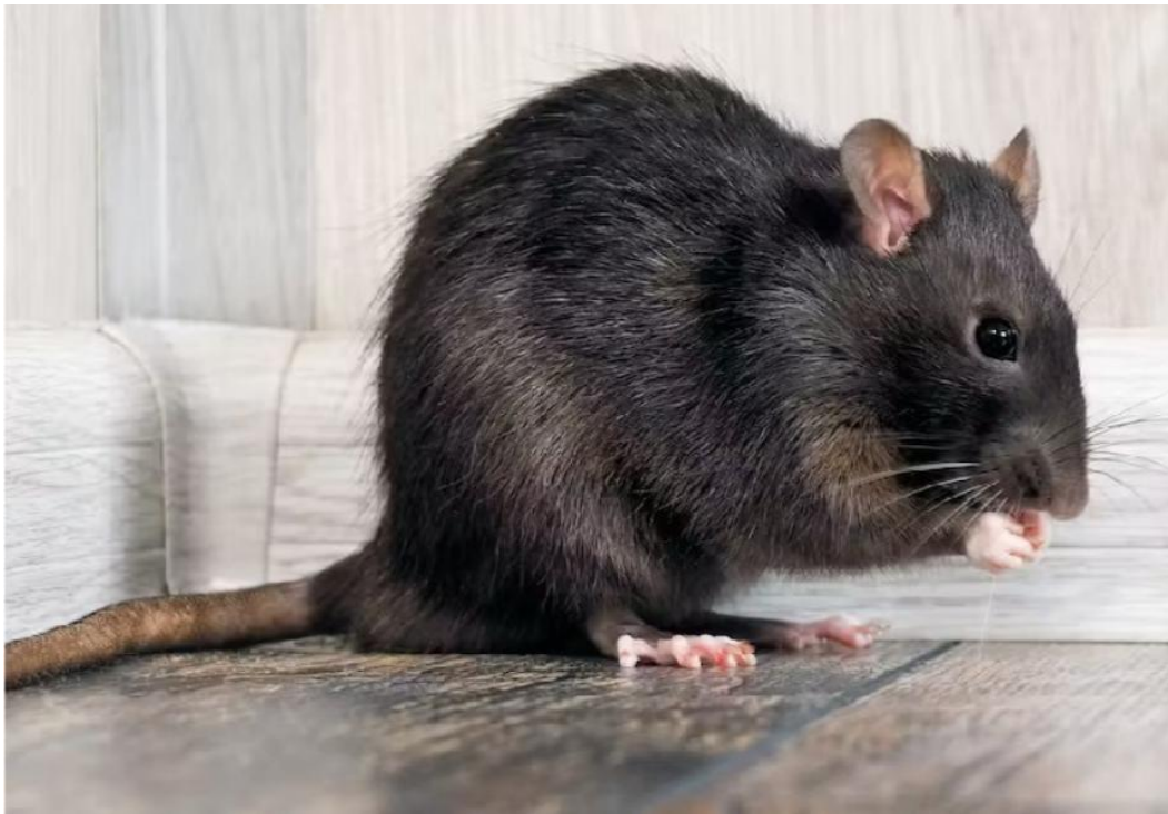
Lesser Bandicoot Rat ( Bandicota bengalensis )