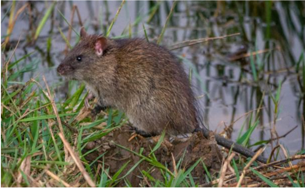
Brown Rat ( Rattus norvegicus )