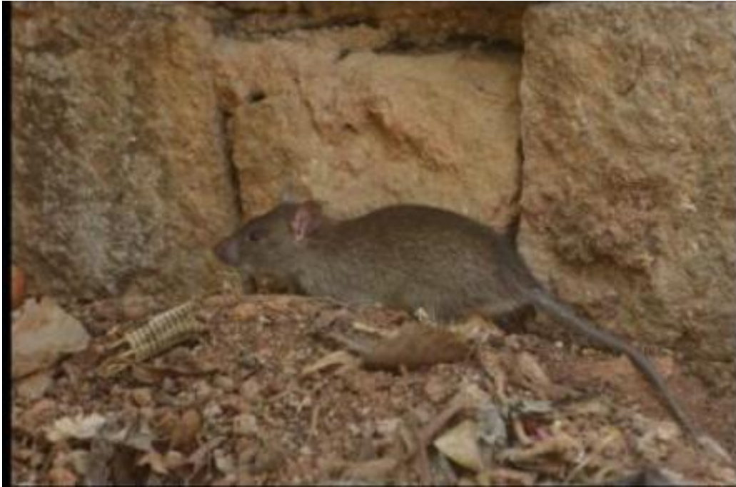
Greater Bandicoot Rat ( Bandicota indica )