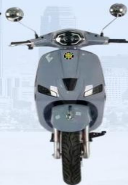
ECOVESPA (NON RTO)