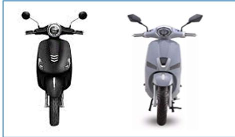
TWO Model Available (Round/Square)