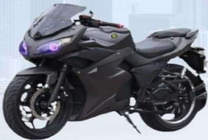
ECOFIRE -DPX (RTO)