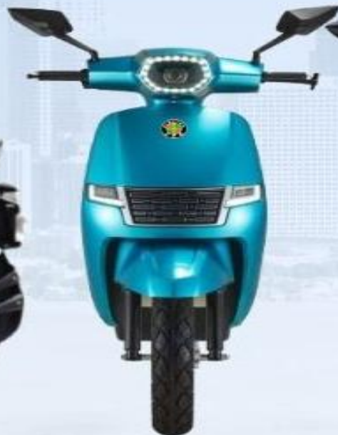
ECOVESPA-XLNW (NON RTO)