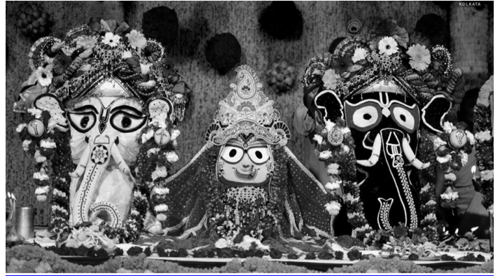
Lord Jagannath, Balabhadra and Subhadra in their elephant form (Hati Vesha)

Jagannatha and Lord Balaram dressed like elephant, and Goddess Subhadra wears a lotus flower vesha.