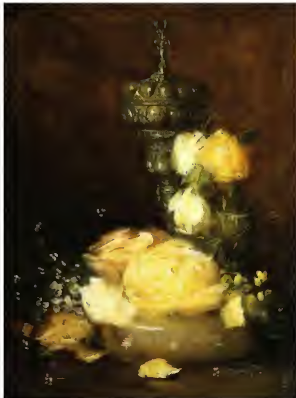
Silver Chalice with Roses, by Julian Alden Weir