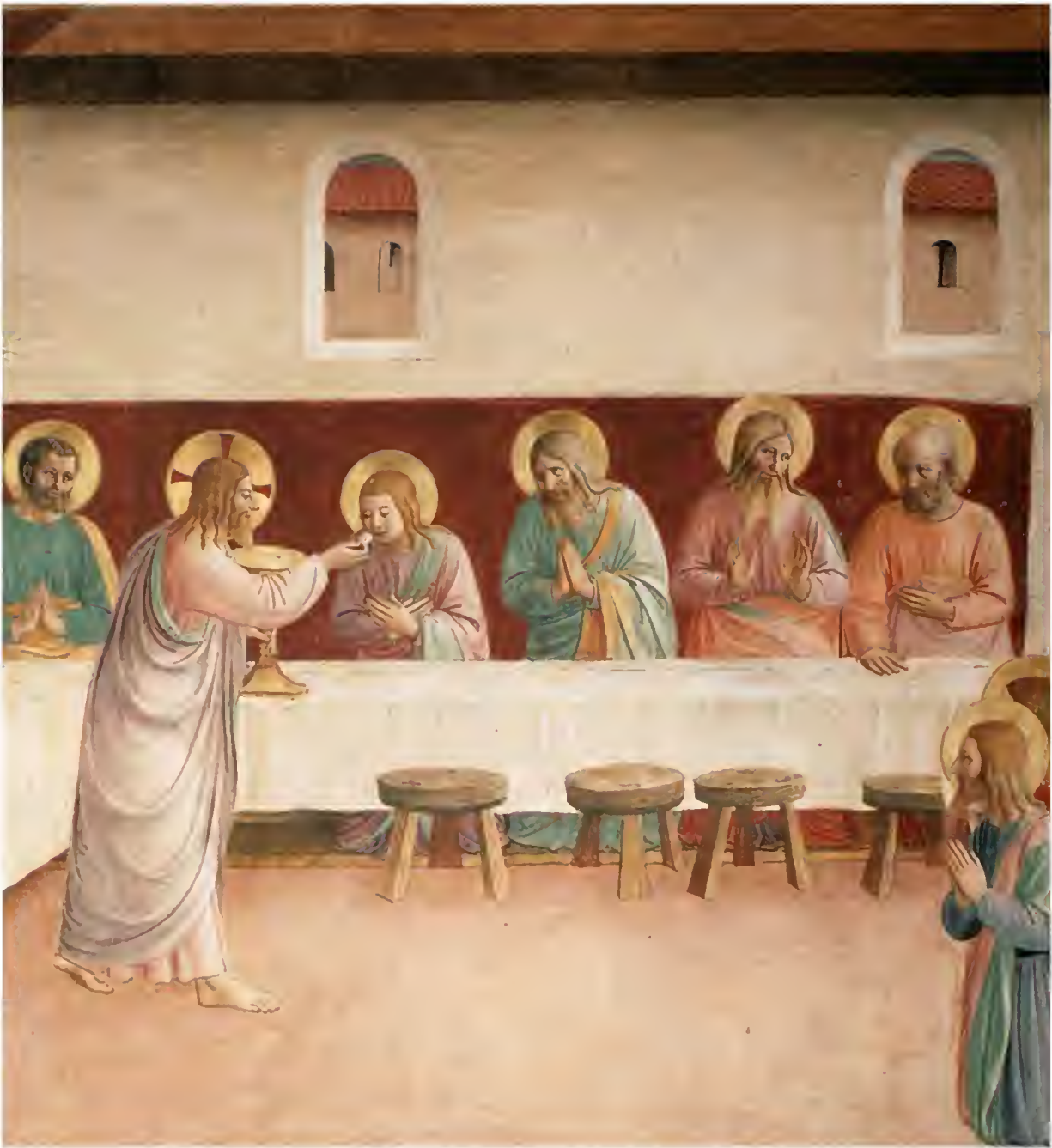
Institution of the Eucharist, by Fra Angelico

“Blessed are the meek: for they shall possess the land.” (Matt. 5:4).