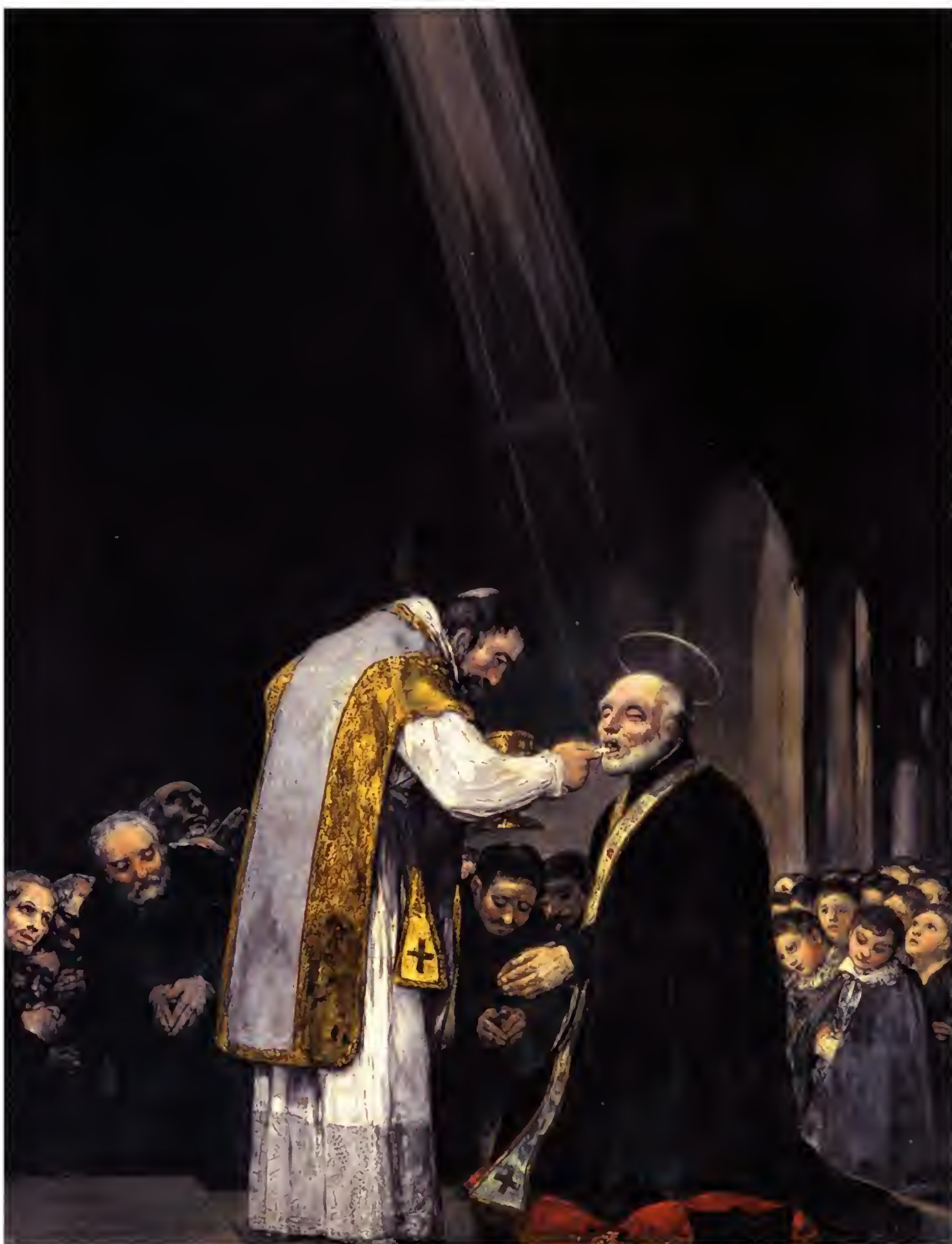
The Last Communion of St. Joseph Calasanz, by Francisco Goya