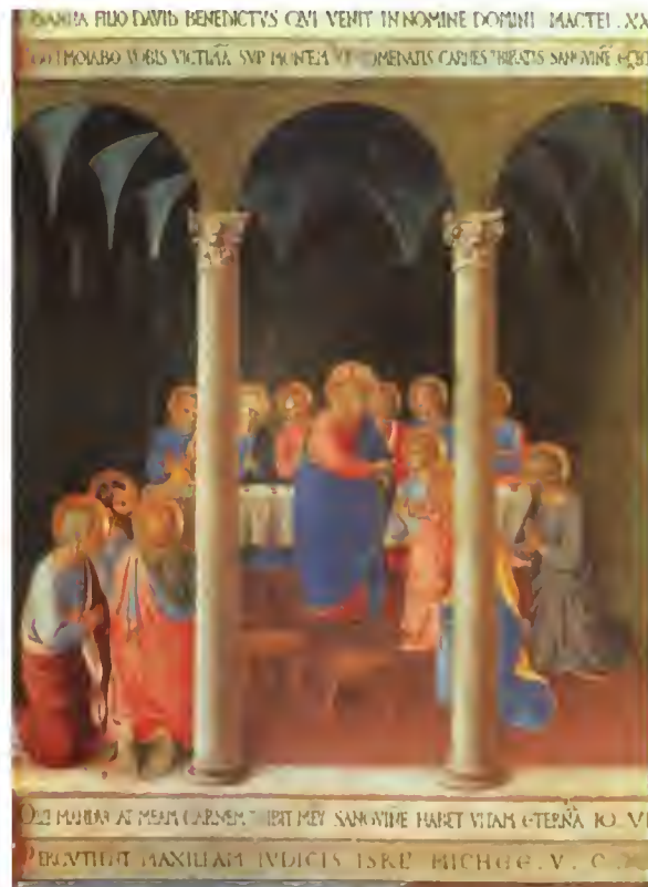
Communion of the Apostles, by Fra Angelico