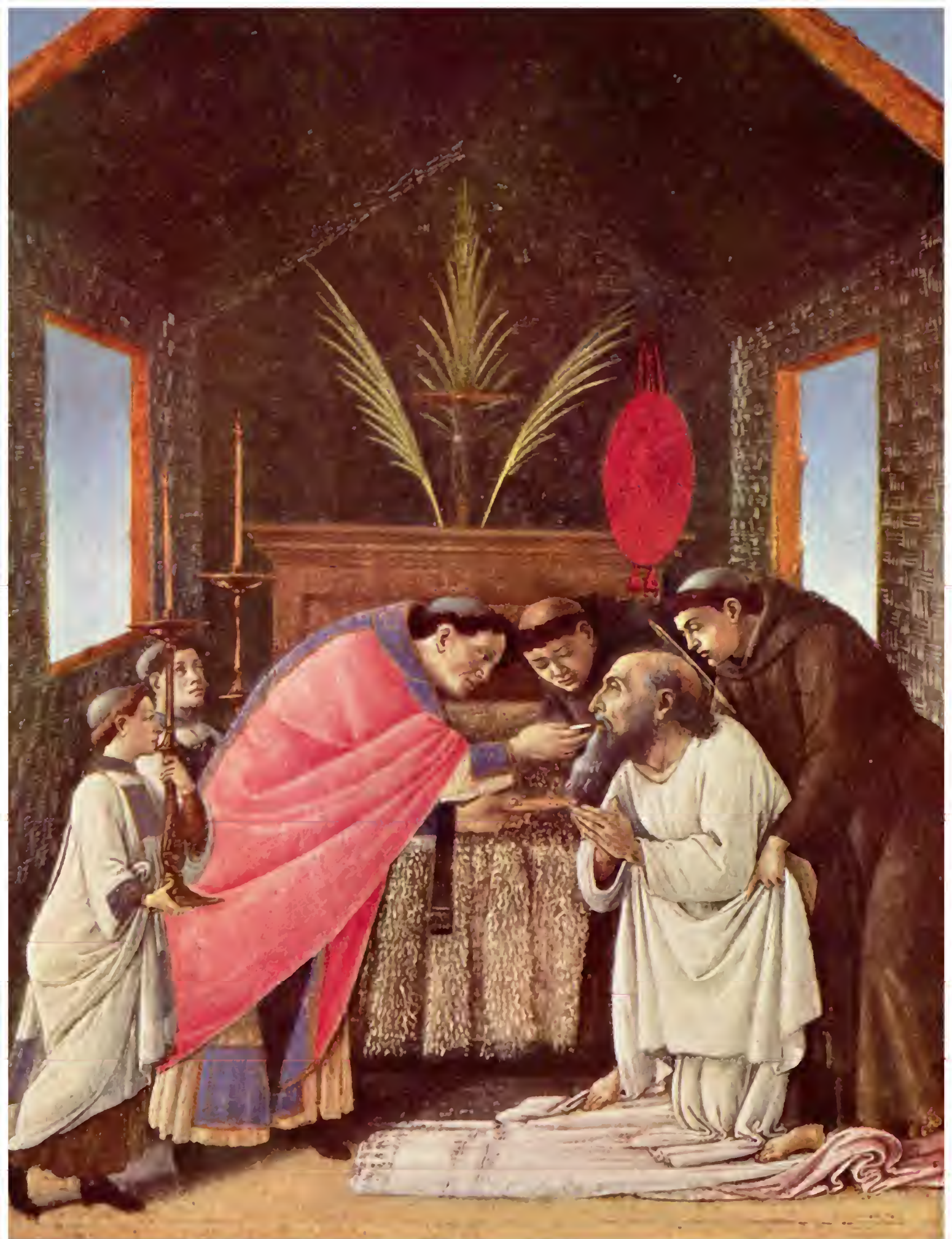
Last Communion of St Jerome, by Sandro Botticelli