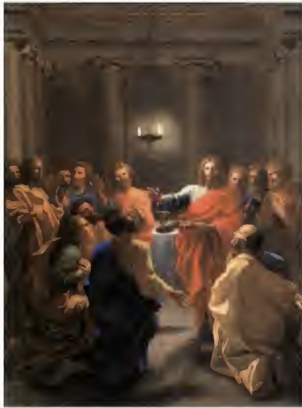
Institution of the Eucharist, by Nicolas Poussin