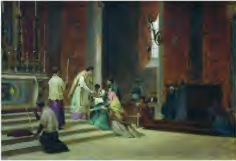
The Catholic Mass, by Fyodor Bronnikov