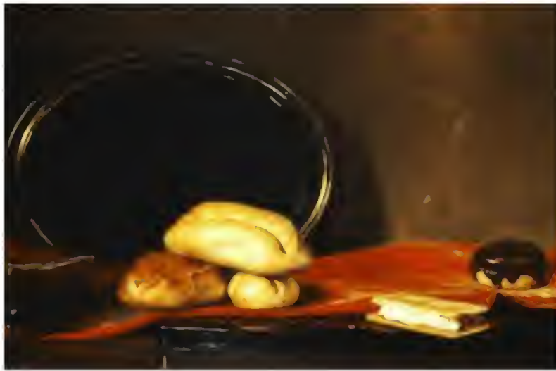
Table or Bread, by Nikolaos Gyzis