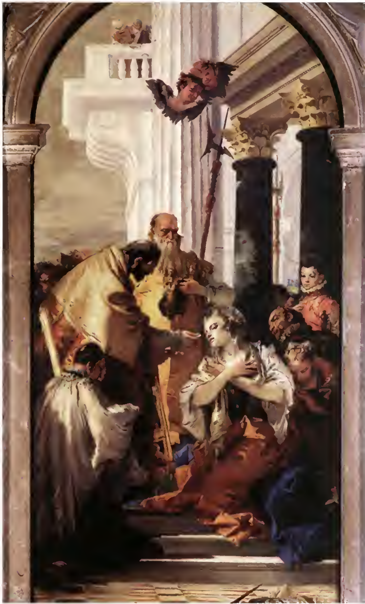
Last Communion of St Lucy, by Giovanni Battista Tiepolo