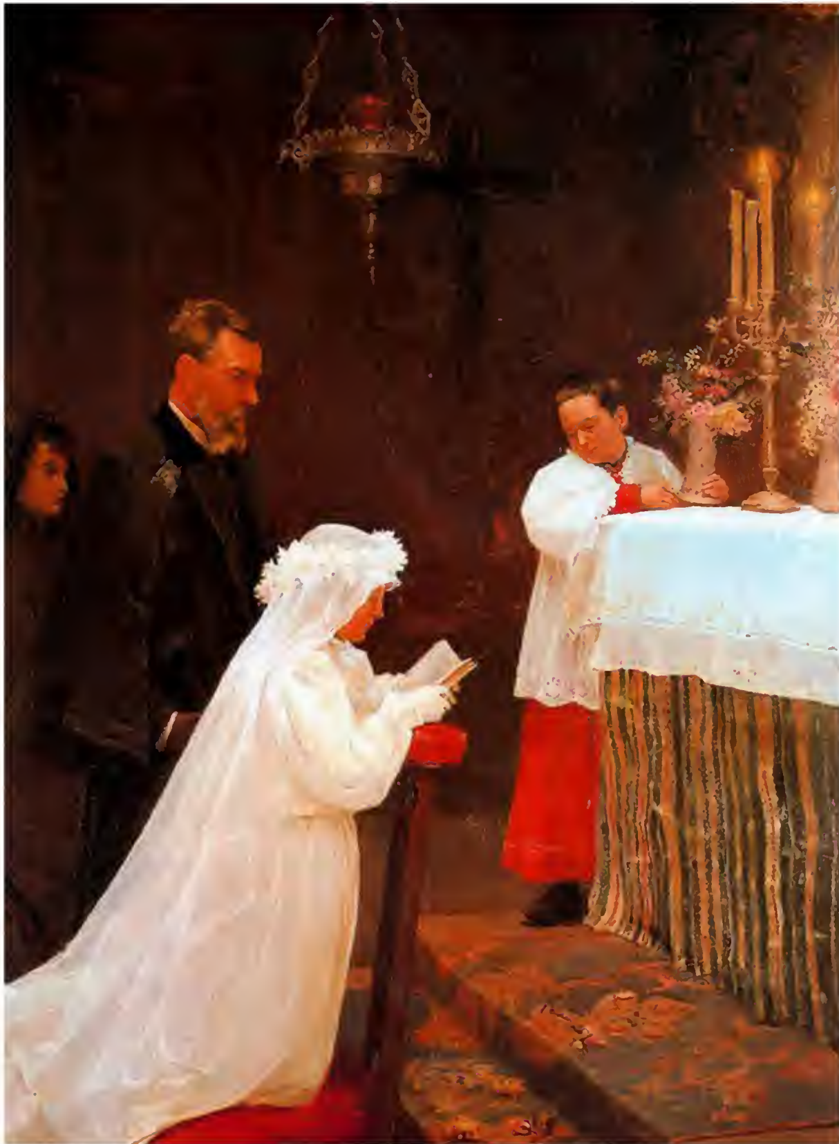
First Communion, by Pablo Picasso

"Blessed are the peacemakers: for they shall be called the children of God." (Matt 5:9).