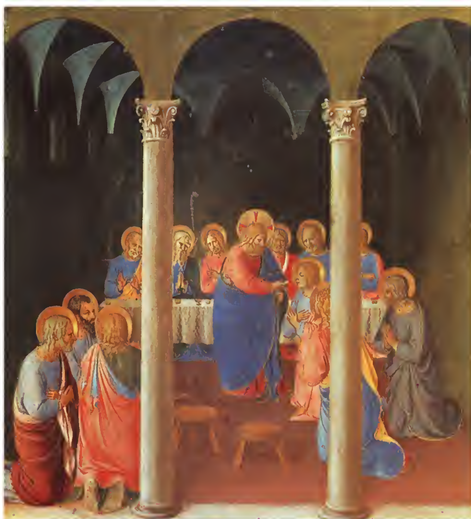
Communion of the Apostles, by Fra Angelico