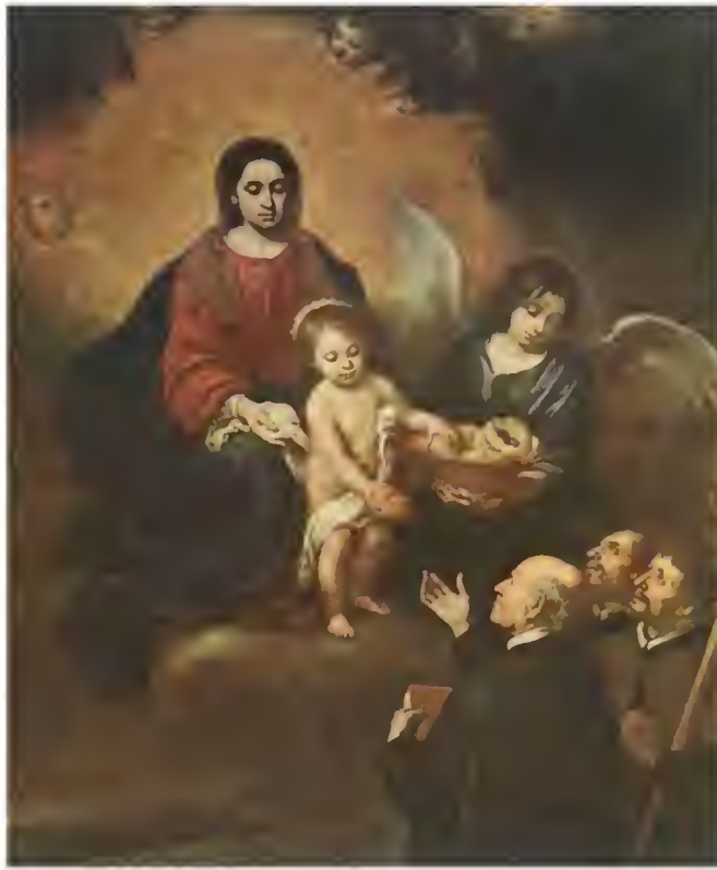
The Infant Jesus Distributing Bread to Pilgrims, by Bartolome Esteban Murillo