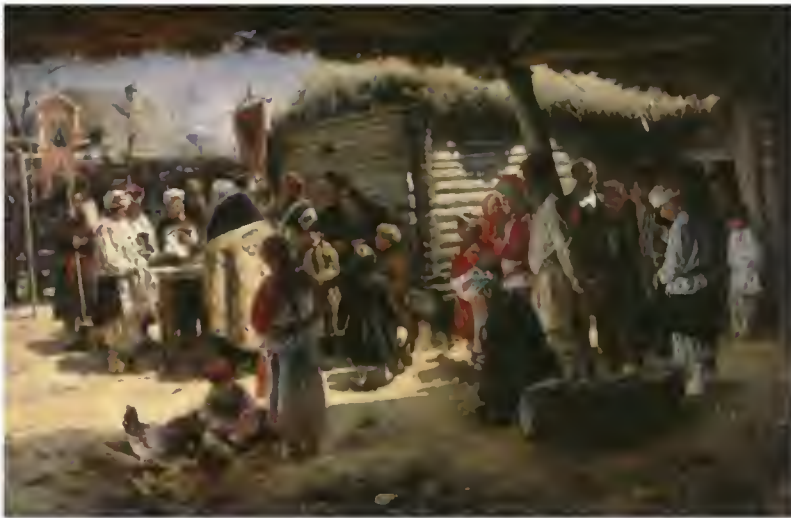
Easter Mass, by Vladimir Makovsky