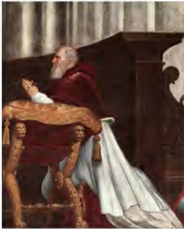
The Mass of Bolsena, by Raphael