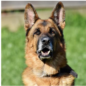
This photo has shadows on one side of the face and the sun is catching his left eye making it look a different colour.