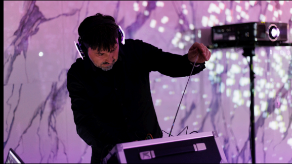
MUSIC and liveFX