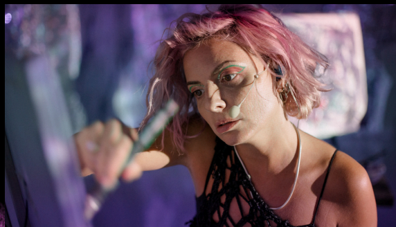
SINGER and PAINTER

Renowned artist manager, founder of YMX and owner of a contemporary art gallery in London, as well as stage manager for numerous illustrious names in Italian pop music. His experience in the world of entertainment has united and coordinated many international events. He has brought together exceptional talents for this performance to create an unforgettable show that captures hearts and souls, transporting audiences into a world of wonder and reflection.