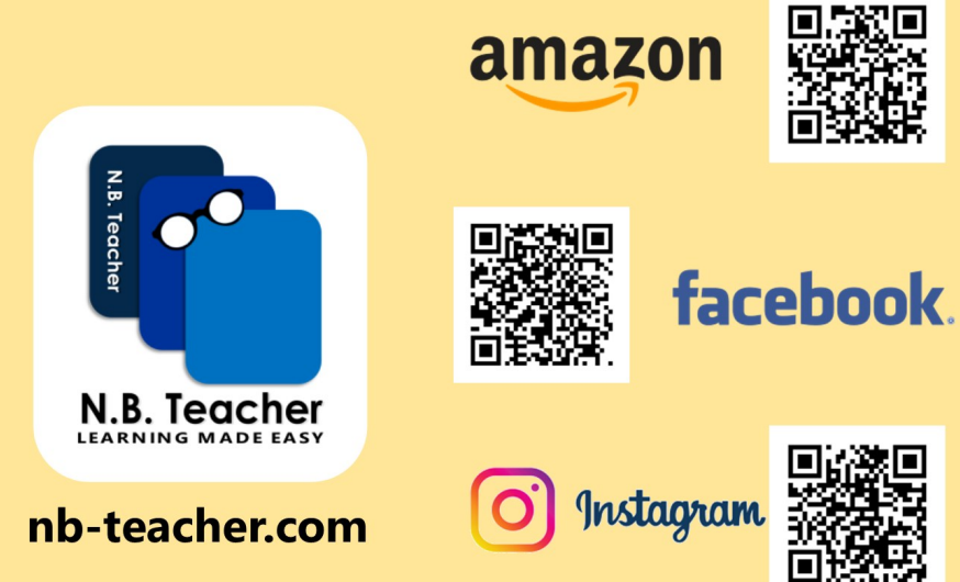
🥪 Look, Point, Learn!