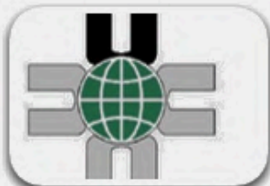
upham international corporation