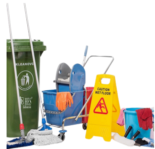
Cleaning Tools #308666