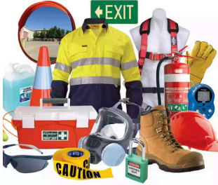
K3/ Safety #308111

#Consumer Goods and Equipments for Offices, Factories, Hotels, Hospitals, etc.