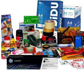
Office Stationaries #308222