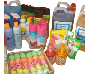
Cleaning Supplies #308333