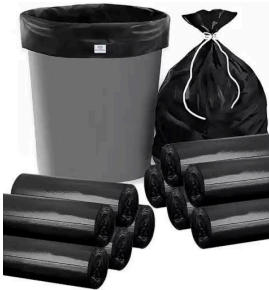
Trash Bag #308444