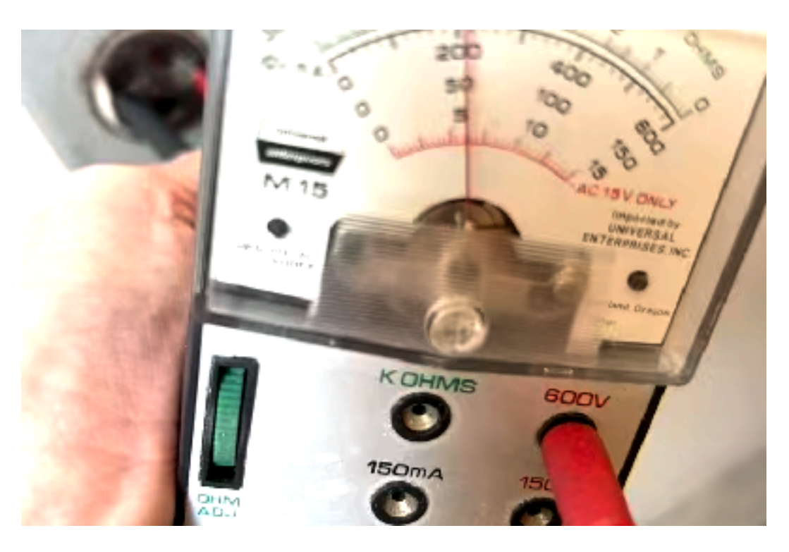
Voltmeter showing ancient outlet in living room at 200 volts - February 2025