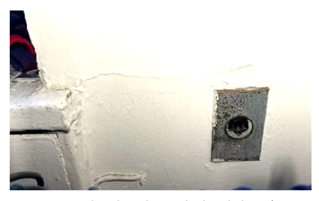
15 amp 125 volt ancient outlet for window a/c