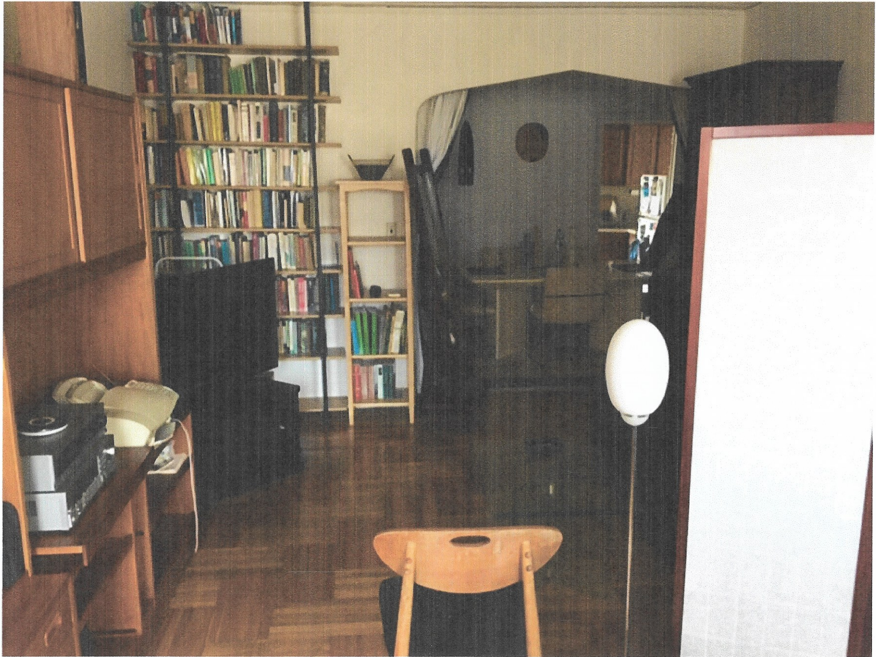
Looking WEST from living room toward dining room