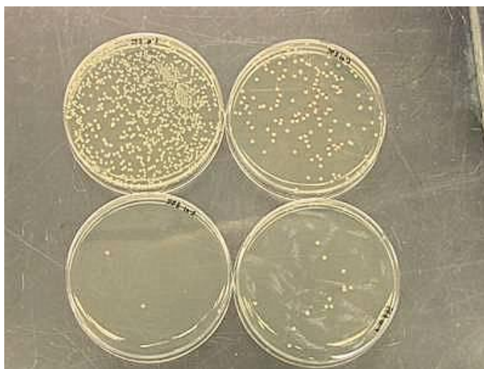
Figure 2. Growth on MRS Agar and MRS cysteine plates after 37 hrs incubation

Five samples of human breast milk taken from healthy mothers volunteers were used as source. Lactic Acid Bacteria were isolated at 37 °C under anaerobic conditions. Some catalase positive bacteria and yeast were also observed. The reason could be the contamination from mother's breast skin. From approximately 100 isolates, 35 isolates remained at the end of the isolation, purification and subculturing (Figure 2.). All of the isolates were gram positive catalase negative rods and cocci. It was understood that the isolates from human milk were so sensitive to the subculturing.