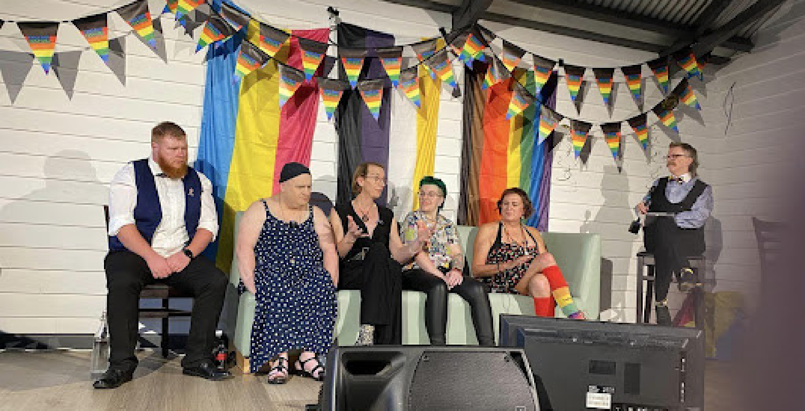
Chillout 2023 panelists discussing Trans and Gender Diverse communities