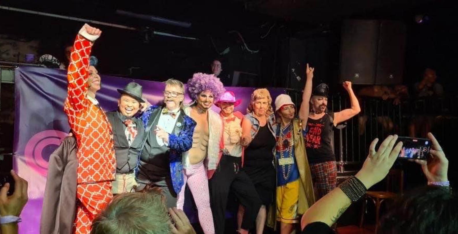
Erskineville Hotel WorldPride 2023