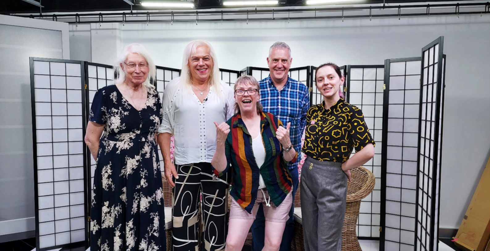
LanceTV Inc. Chairperson with Bent TV crew on set at C31