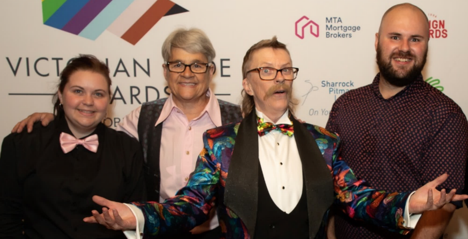
The LaNCE TV crew at the Victorian Pride Awards