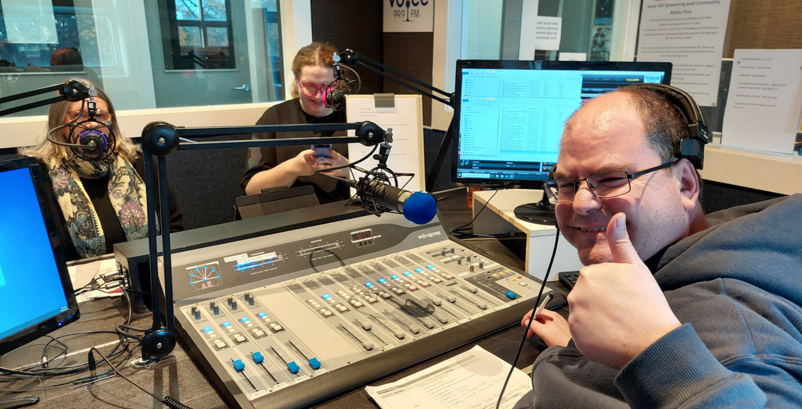
The team from Ballarat's own LGBTIQA+ radio show - Sunday Spectrum.