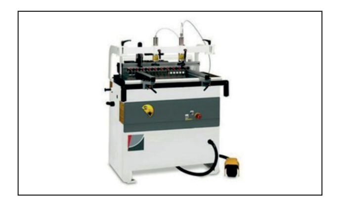
Multi Boring Machine multiple application flexibility and High-production