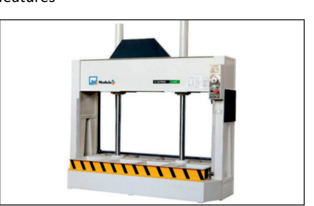
Cold Press Machine press laminating for panel board strength and durability