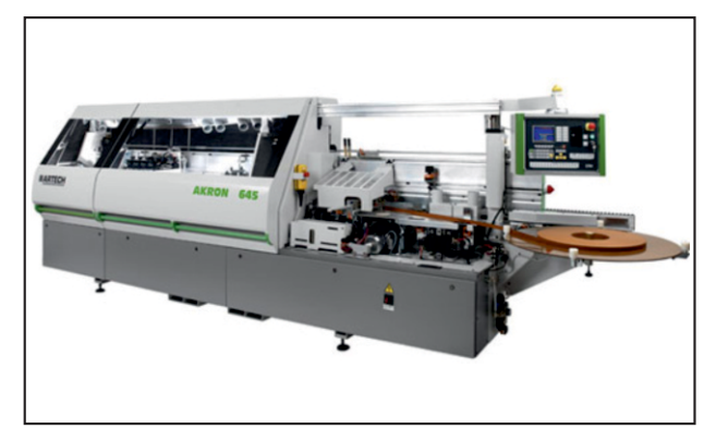
Highly Flexible Machine series for edge binding