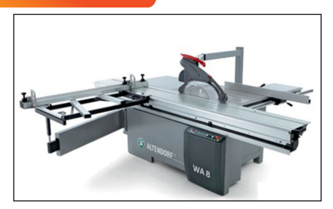
High-tech cutting machine with exclusive features