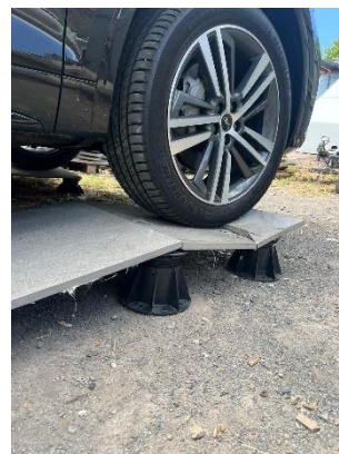
A CAR SITTING ON A BROKEN TILE.