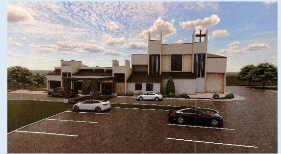
*Covered Front Entry-Connecting Drive

*Images are representative of the minimum proposed expansion. Additional elements may be added contingent on funds raised and Congregation approval.