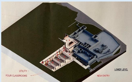
*New Lower Entry and Four New Classrooms

We are launching a fundraising campaign to raise the necessary funds for this important step in our church's future. We invite you to join us in this bold, collective effort as we seek to expand our space, enrich our ministries, and deepen our impact.