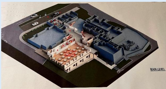
*New Activity Center