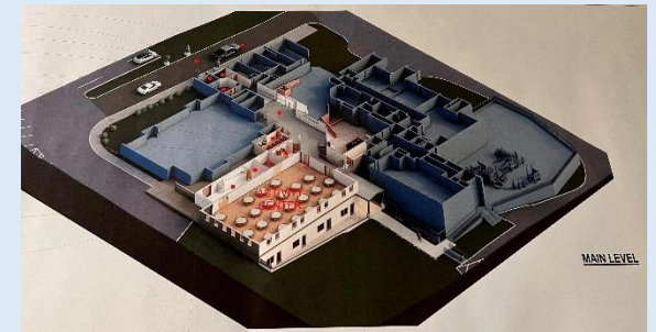
*New Upper Entry and Activity Center