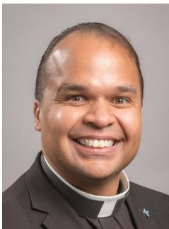
President/Bishop Atlantic District LCMS