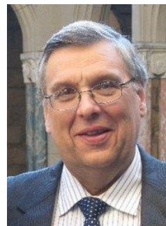
Pastor Emeritus St. Luke Lutheran Church

RSVP to this exciting event by clicking the RSVP button on the homepage of the website https://stlukedixhills.org or scan the QR code →