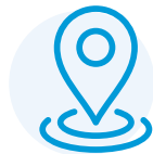
Option to choose a location near you