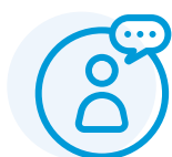
Choice of doctor