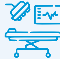
Choose your treatment