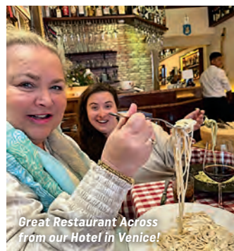
Great Restaurant Across from our Hotel in Venice!