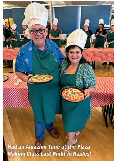
Had an Amazing Time at the Pizza Making Class Last Night in Naples!