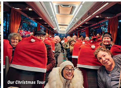
Our Christmas Tour