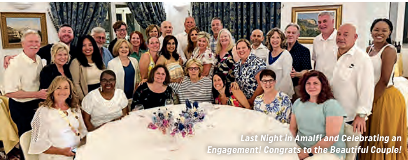
Last Night in Amalfi and Celebrating an Engagement! Congrats to the Beautiful Couple!