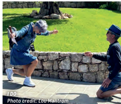
I DO