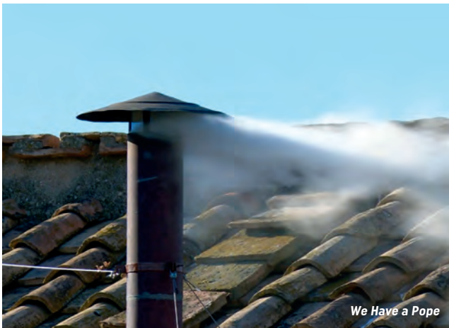
We Have a Pope