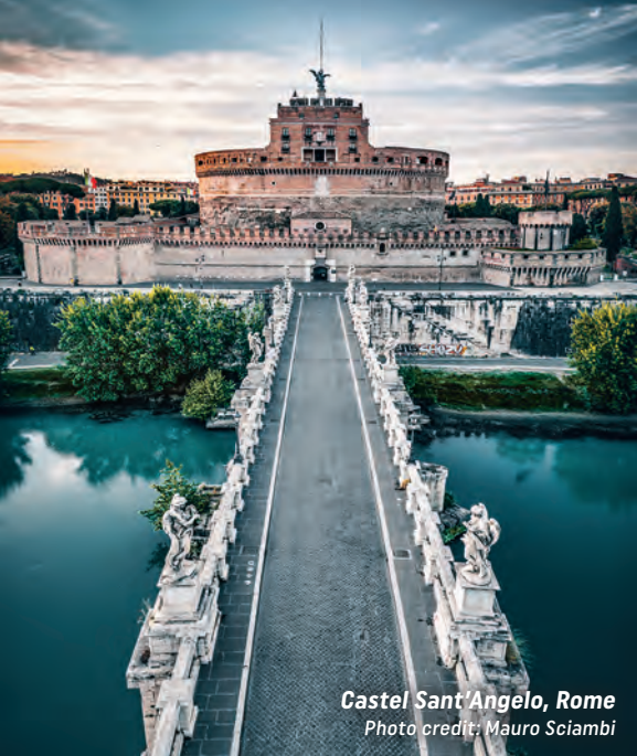
Castel Sant'Angelo, Rome