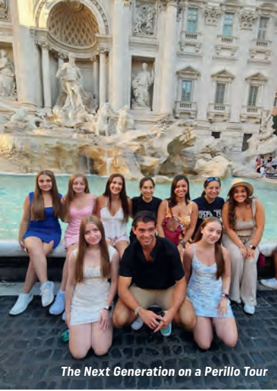
The Next Generation on a Perillo Tour