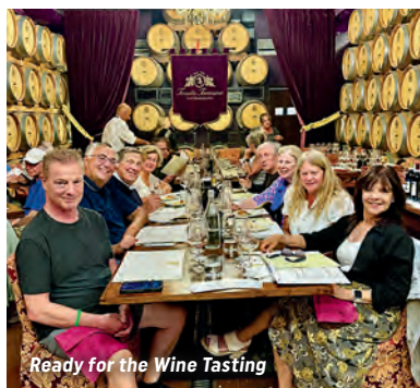
Ready for the Wine Tasting