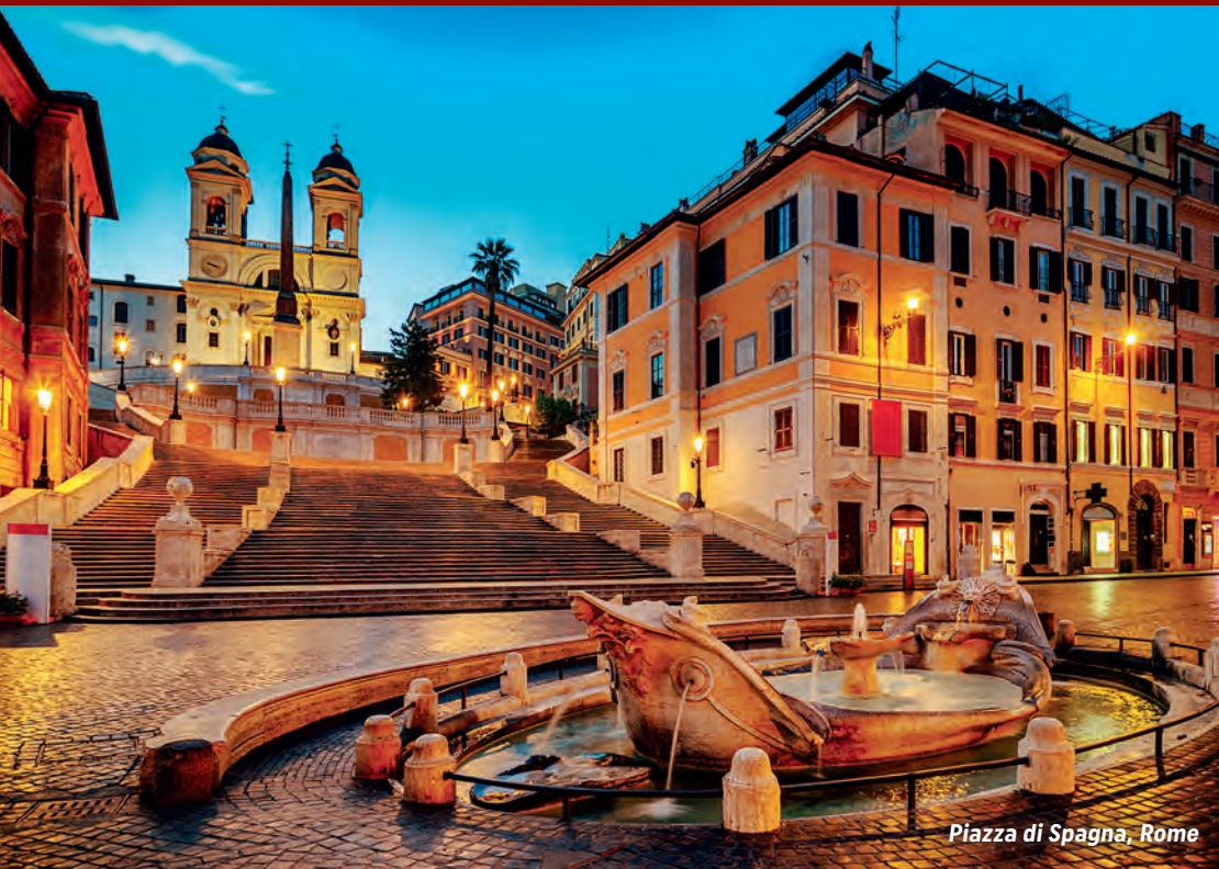
Piazza di Spagna, Rome