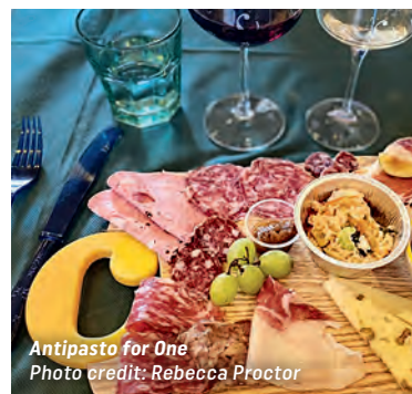
Antipasto for One