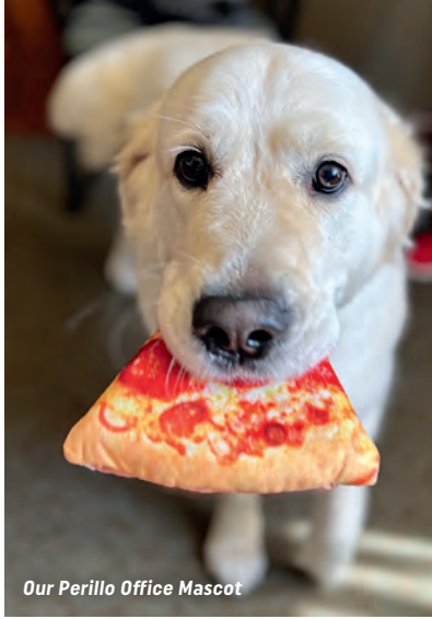
Our Perillo Office Mascot