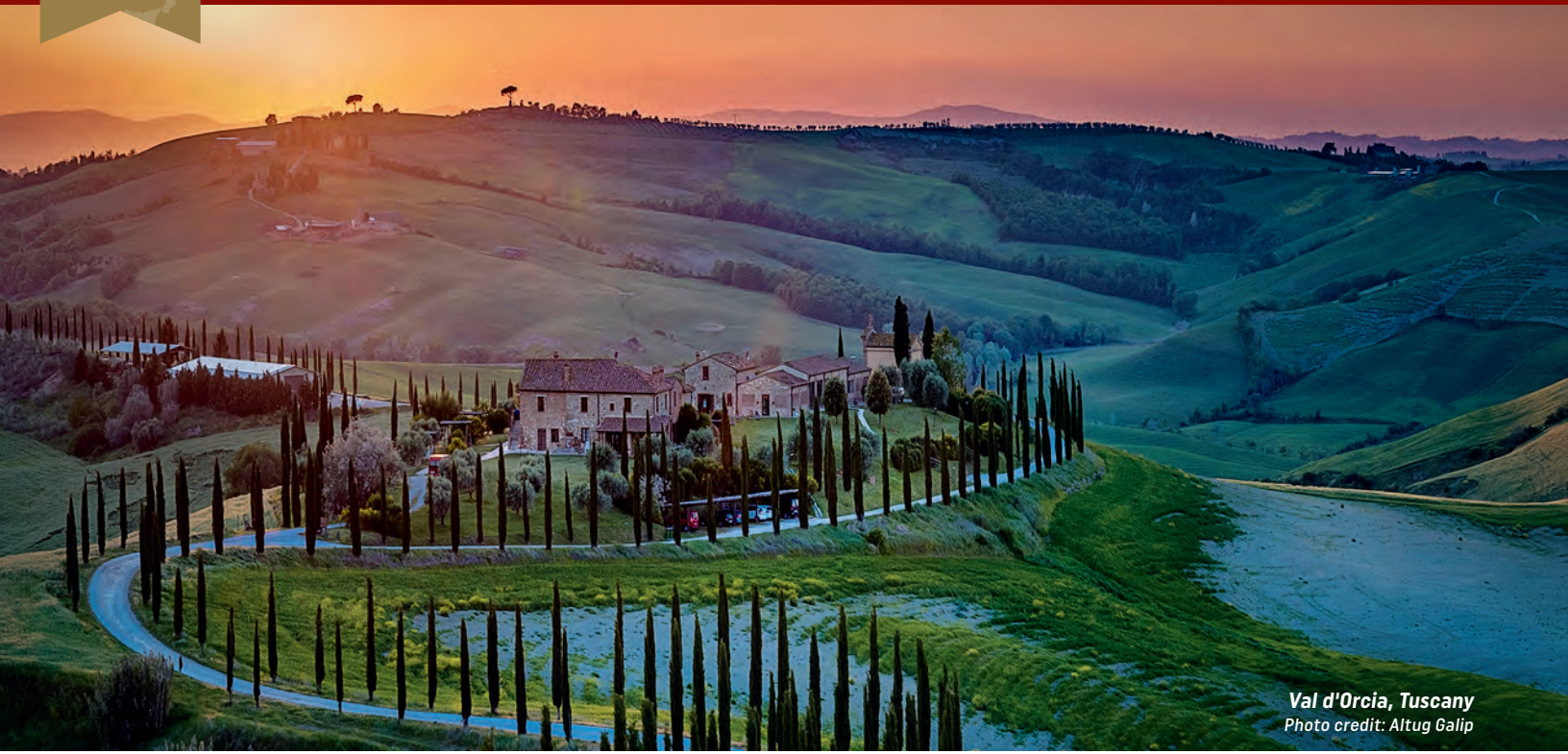
Val d'Orcia, Tuscany