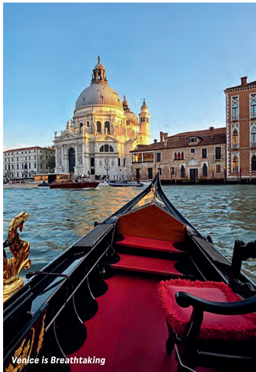
Venice is Breathtaking