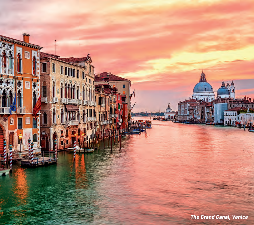
The Grand Canal, Venice