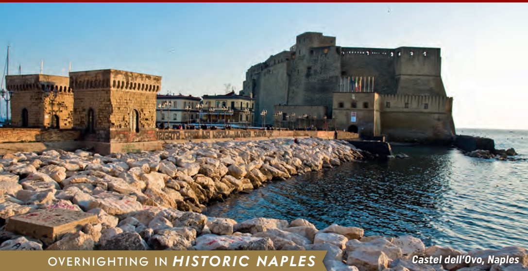
Castel dell'Ovo, Naples