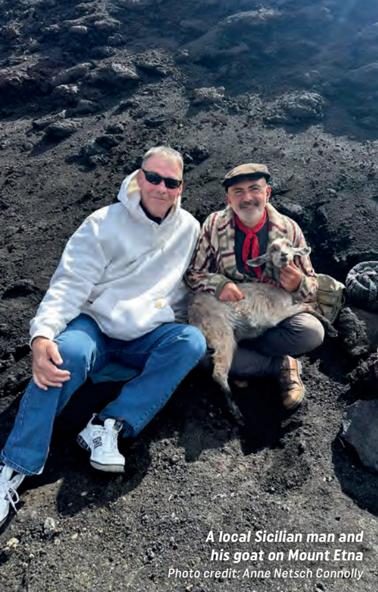
A local Sicilian man and his goat on Mount Etna