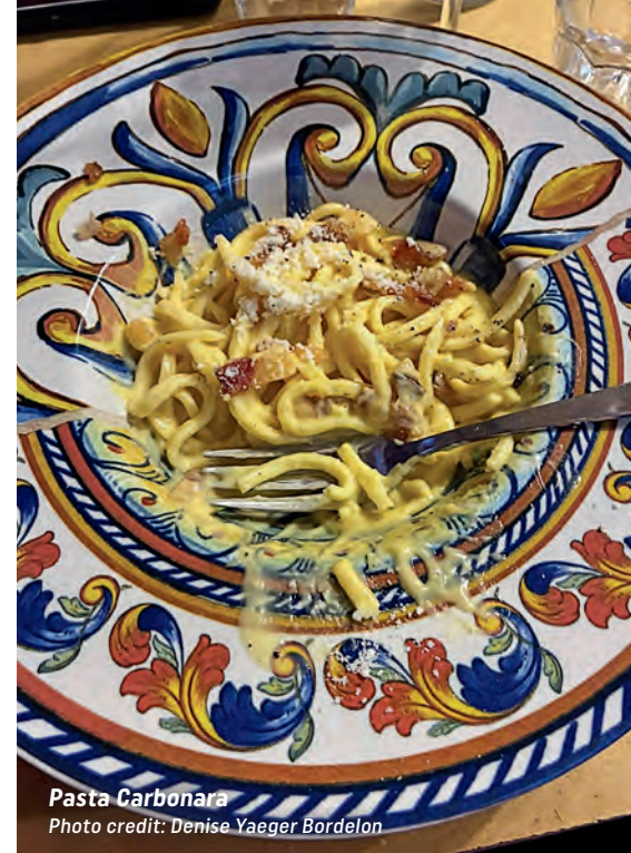
Pasta Carbonara