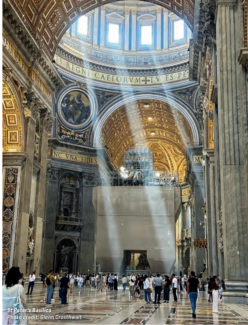
St Peter's Basilica