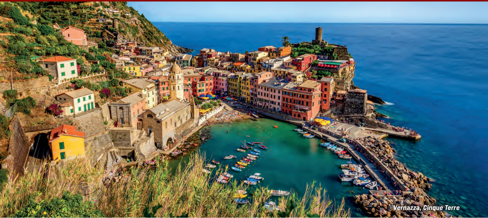
Vernazza, Cinque Terre