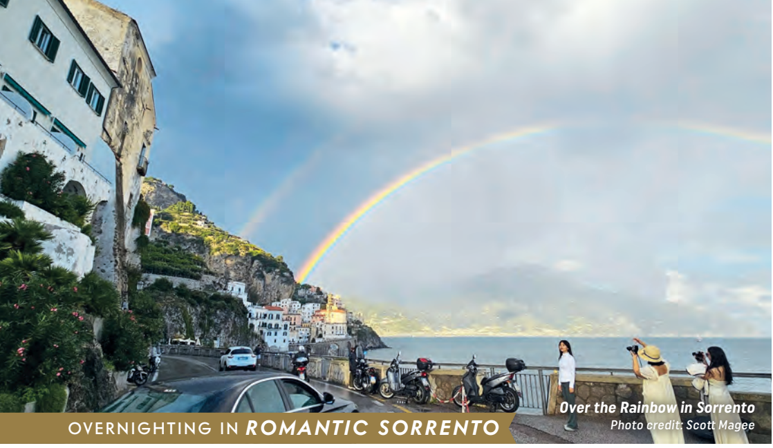
OVERNIGHTING IN ROMANTIC SORRENTO