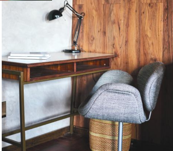
'This beautiful Little tulip chair was designed by Pierre Paulin for Artifort in the Netherlands in 1965. It is one of the essential classics in the history of modern furniture'