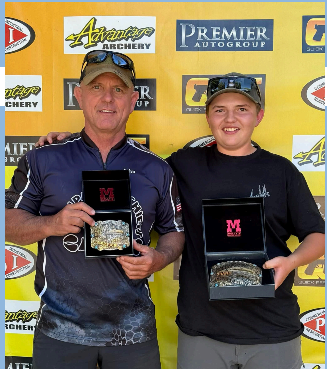
BOW CHIEF BUCKLE WINNERS FROM THE MAGIC MOUNTIAN 3D SHOOT!