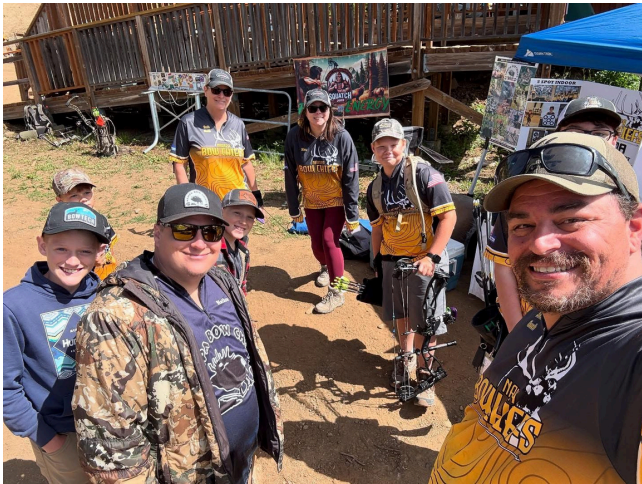
BOW CHIEF MEMBERS AT THE MOUNTIAN CHALLENGE VOLUNTEERING A BOOTH