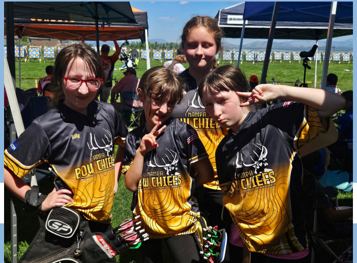
FEW KIDS FROM S3DA IN HELENA, MT AT THE NATIONAL TOURNAMENT