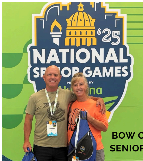
BOW CHIEFS AT THE SENIOR GAMES IN IL!