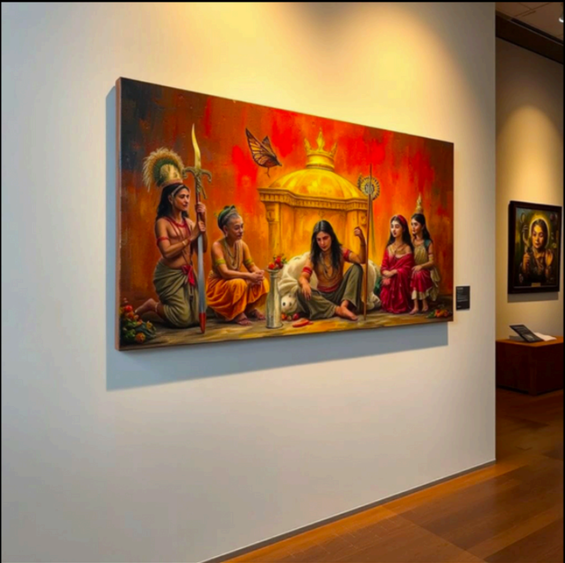
Lands of Inheritance