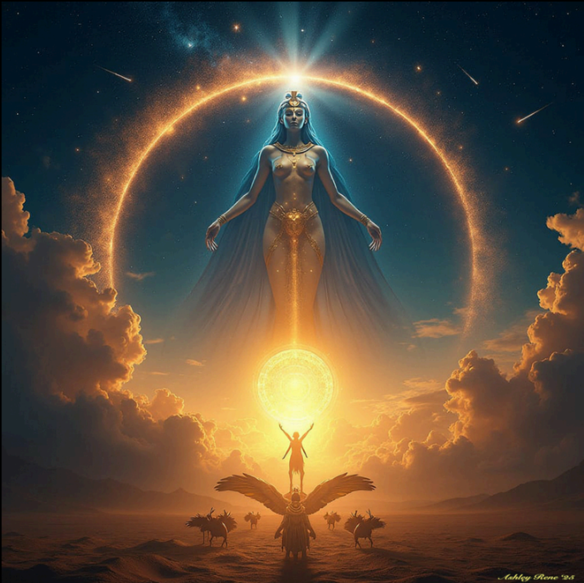
The Dawn of Creation