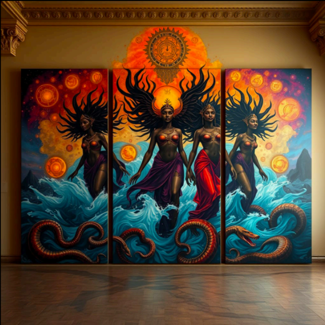
Daughters of the Solar Abyss