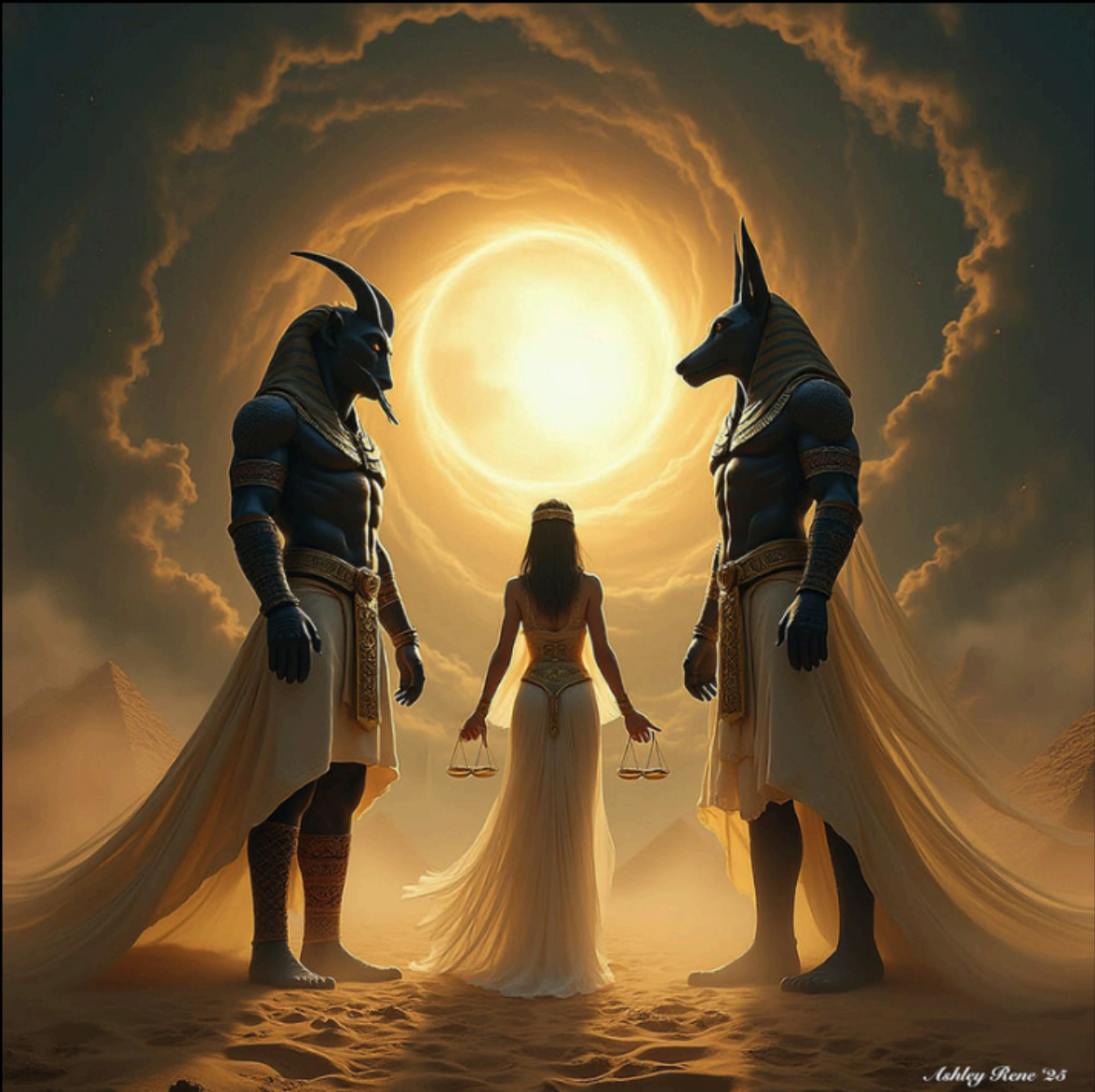
The Final Judgment