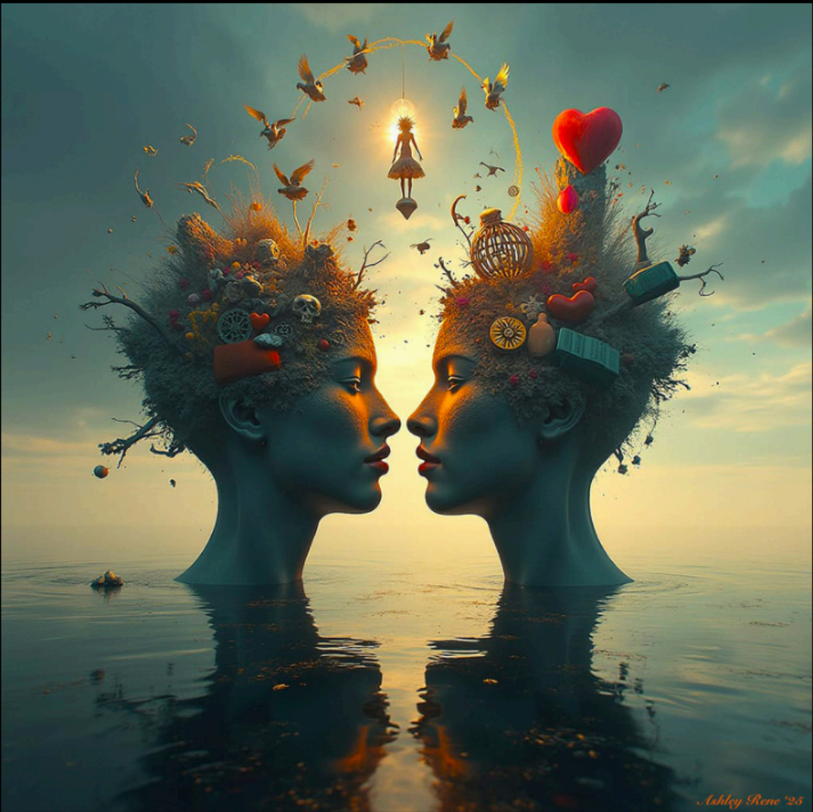
The Bridge Between Minds