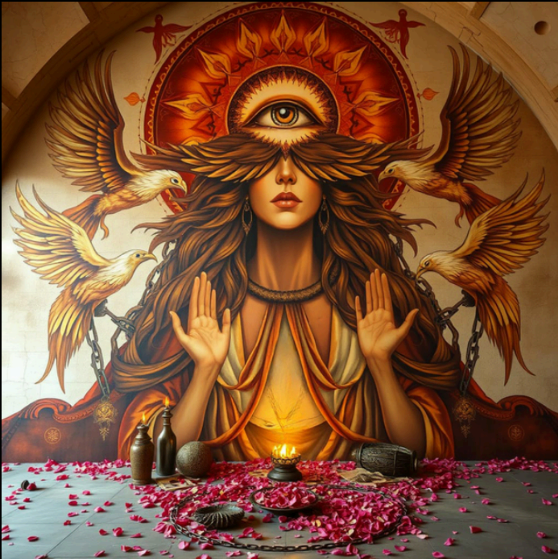
She Who Sees Without Eyes