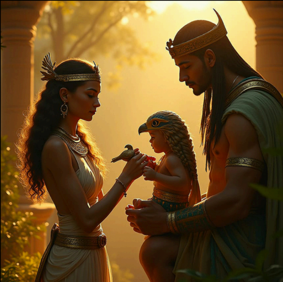
The Divine Bond