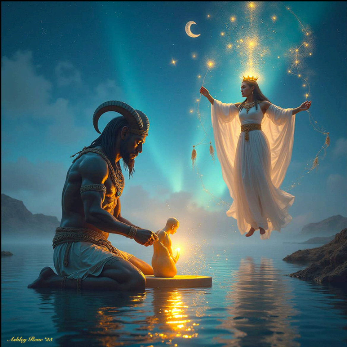
The Breath and the Clay