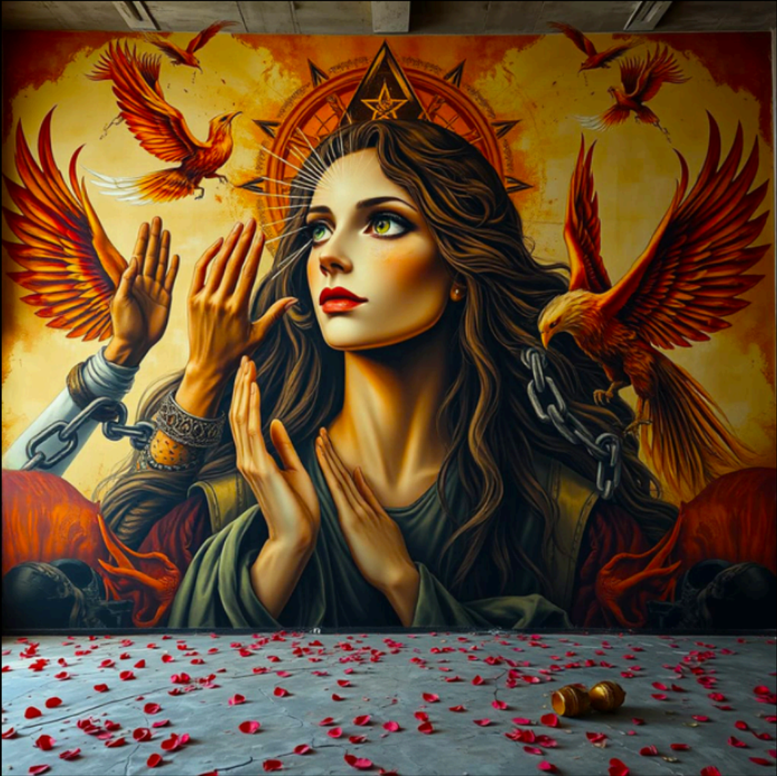
The Benediction of Release