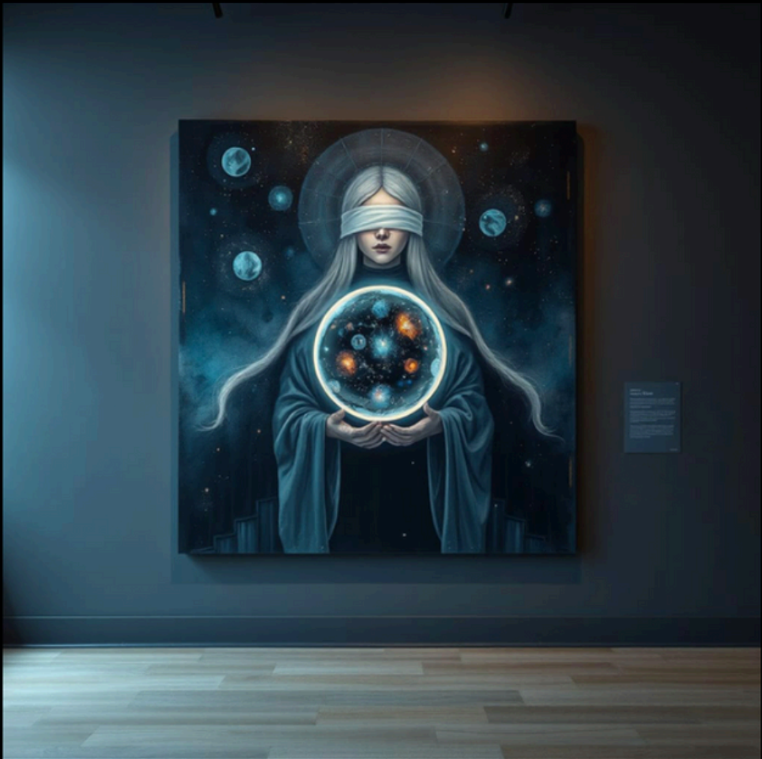
She Who Holds The Unseen