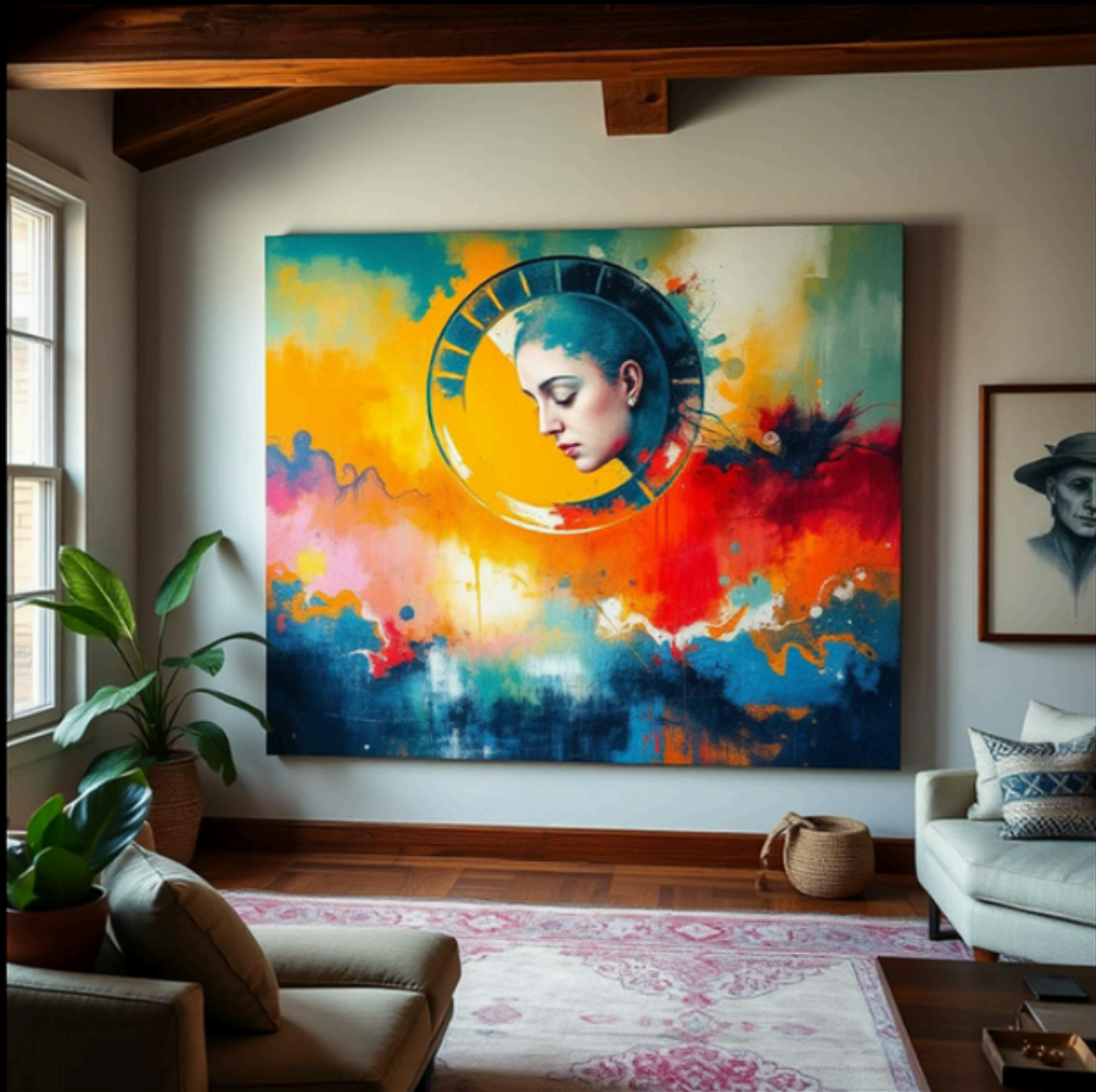
Within the Hours