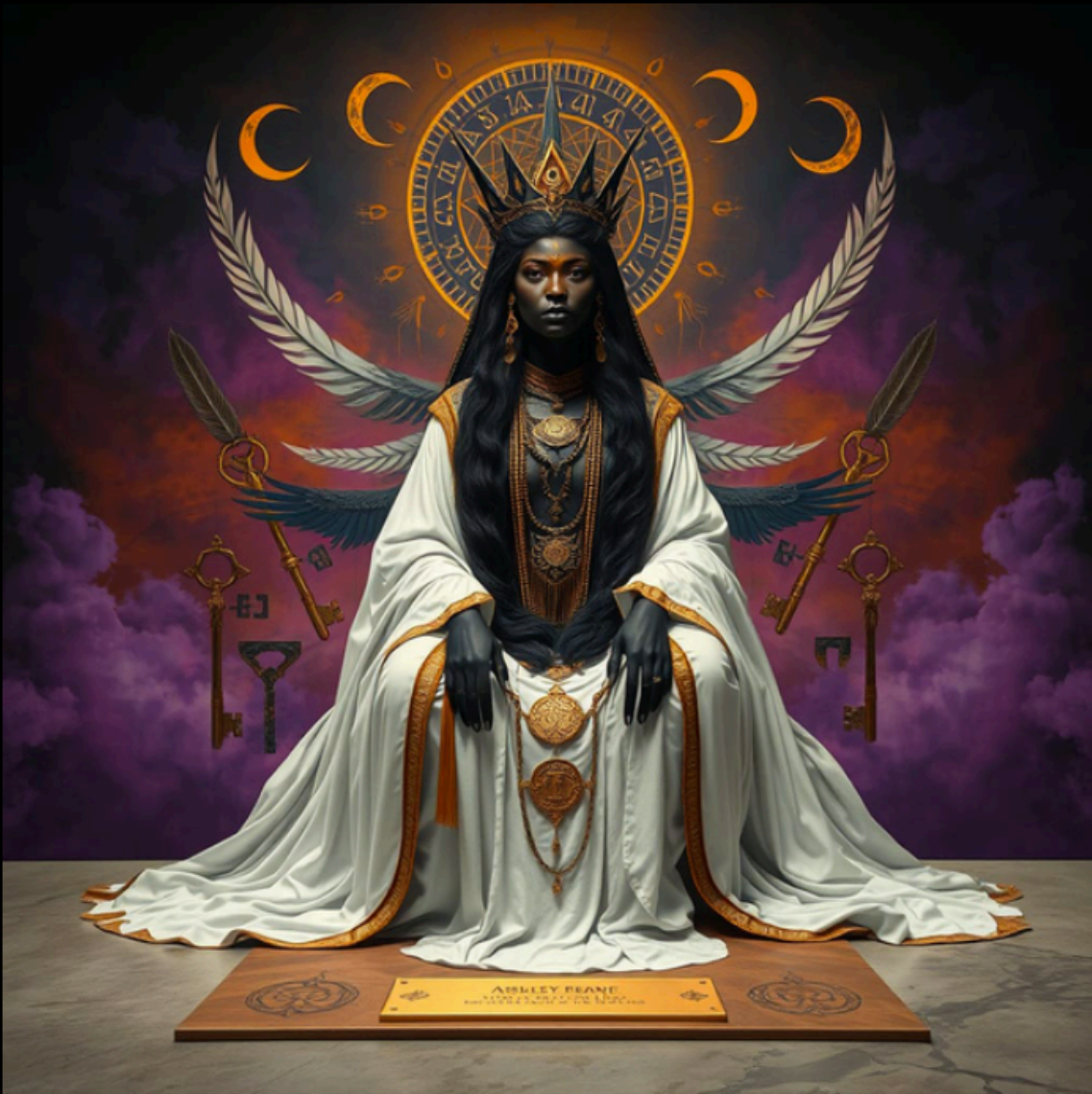
The Oracle of the Unseen