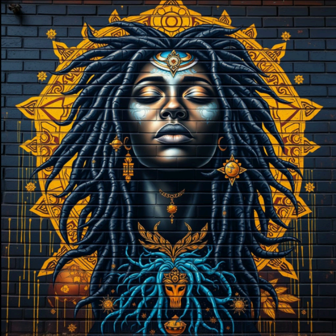
Mother of the Veil